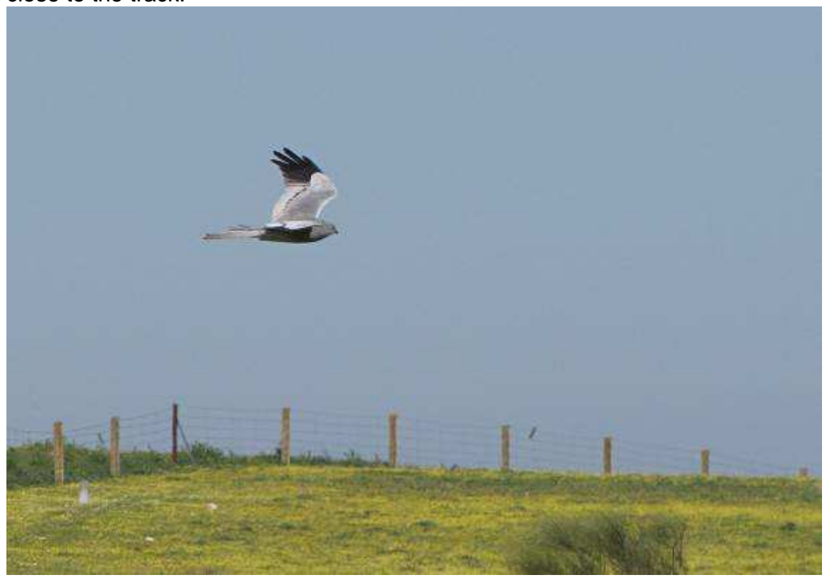
North of the village, we enjoyed close views of Montagu's Harriers and two male Little Bustard , very close to the road.

and as well as the Calandra Larks , we found a pair of Short-toed Larks feeding close to the track.