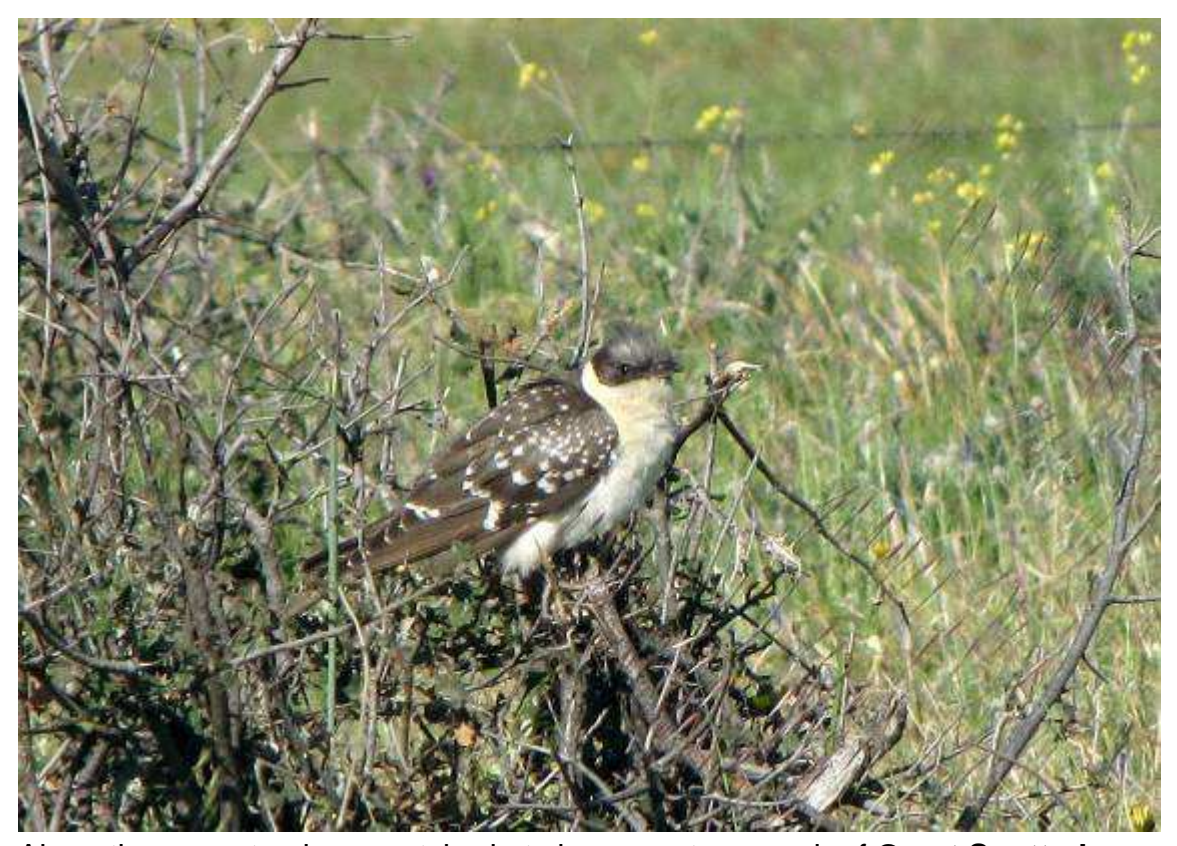
Along the same track we watched at close quarters a pair of Great Spotted Cuckoos , the male collecting caterpillars to courtship-feed the female, which waited for him in a small bush. A Little Bustard gave its "blowing a raspberry" courtship call

Another wonderfully clear day and we explored the area of plains between Trujillo and Cáceres. In the first area we explored, to the east of the village of Santa Marta de Magasca, we started with excellent flight views of several groups of Pin-tailed Sandgrouse , followed shortly afterward by superb views of a party of Black-bellied Sandgrouse feeding on fallow. A pair of Pin-tailed Sandgrouse was with them briefly.