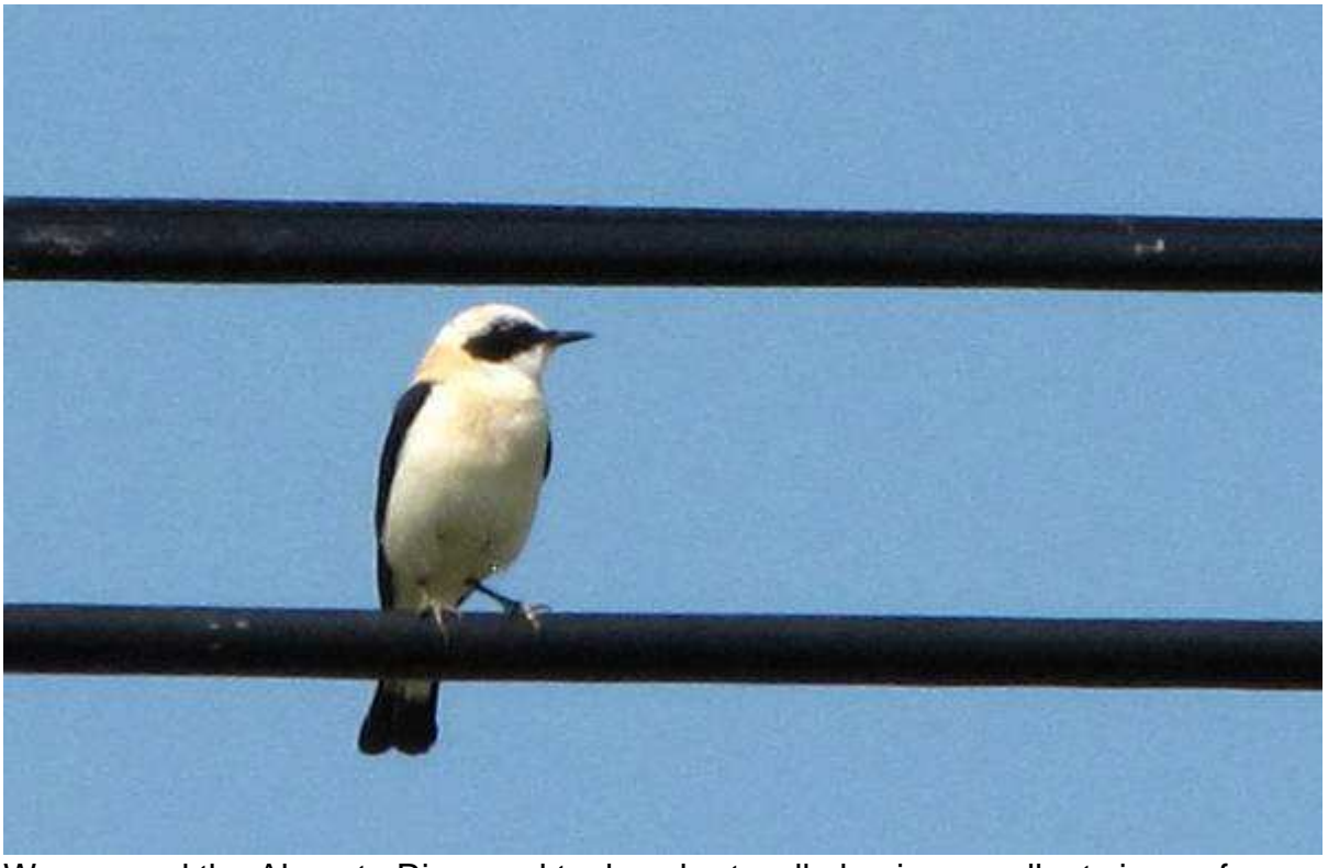
We crossed the Almonte River and took a short walk, having excellent views of three Egyptian Vultures , a Booted Eagle and a Short-toed Eagle . After lunch