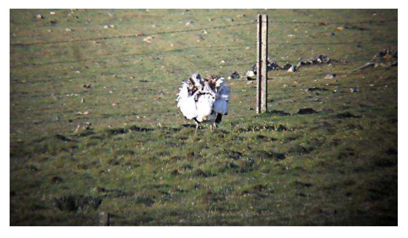
The fight was aggressive, the birds pushing each other, one clasping the other's head in its bill. They edged towards a fence, sometimes almost forcing each other to the ground. As they fought, some females Great Bustards walked past, almost appearing indifferent. And then, as suddenly as it had started, the males separated, one appearing slightly injured on the head. It was an extraordinary episode. Close