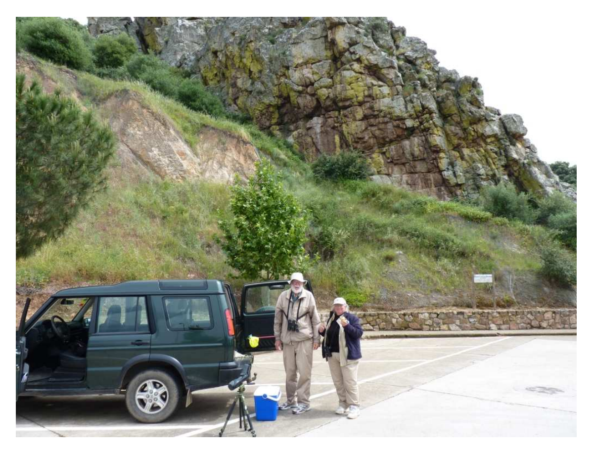
30<sup>th</sup> April 2011

home, through yet another heavy downpour and finally along a section of quiet country road where we counted no fewer than nine Woodchat Shrikes !