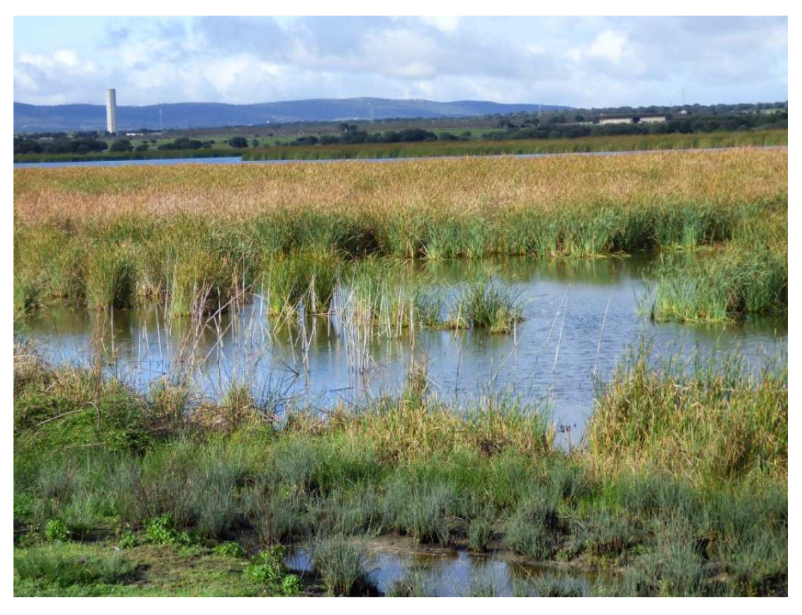
Day 6: 14th November 2014

The final morning in Extremadura dawned misty with some rain, but during the morning there were long periods of fine weather for our drive back to Madrid. We stopped for about an hour at the Arrocampo Reservoir, built to provide cooling water for the Almaráz nuclear power station. It was a very productive stop with several