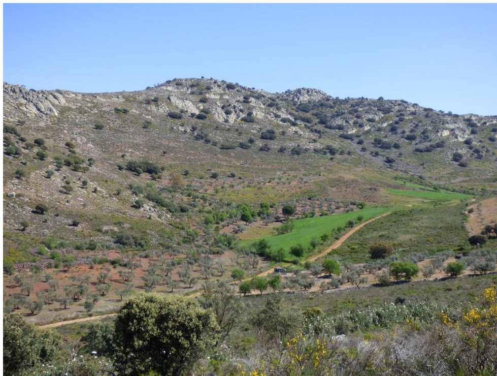
The Hidden Valley

Following lunch there we returned to Alange and had an excellent walk close to the castle where we found a further six species of orchid including the very rare Bumblebee Orchid , as well as Yellow Bee , Woodcock , Pink Butterfly , Sawfly and Early Spider .