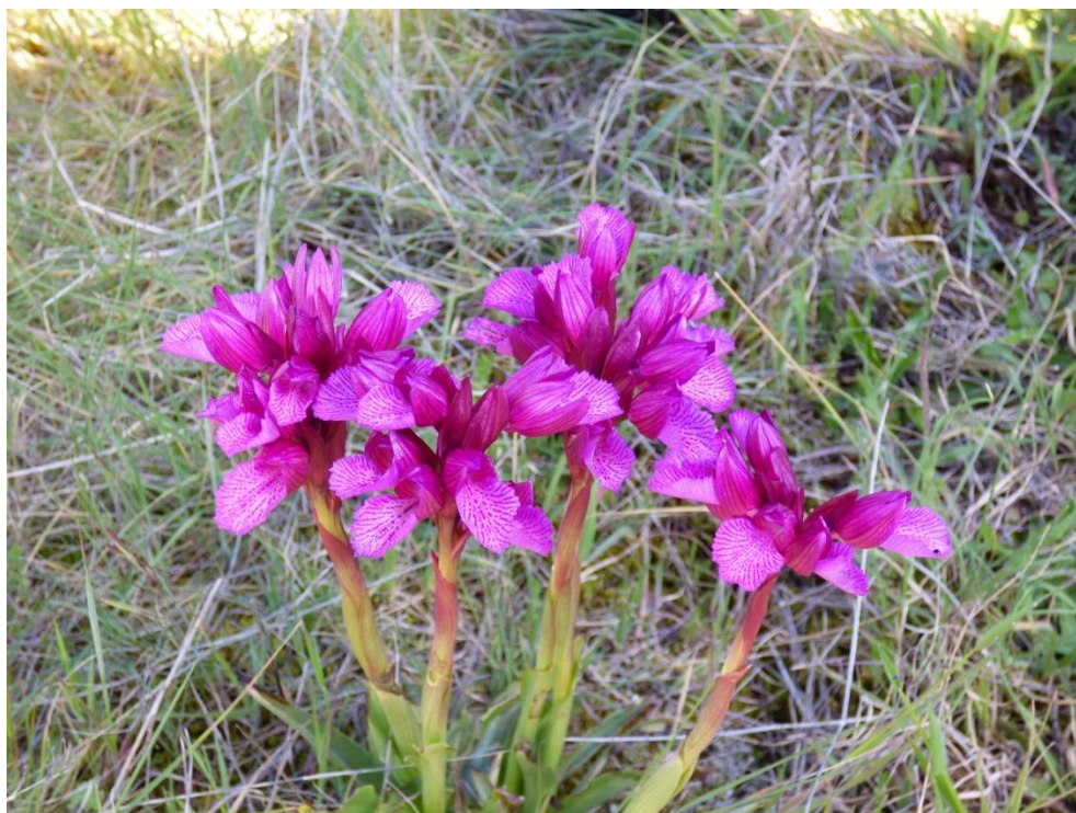
Pink Butterfly Orchid

We drove towards Trujillo slowly, getting great views of Woodchat Shrikes , Northern Wheatear , as well as briefer views of Spanish Sparrow and an Eagle Owl .