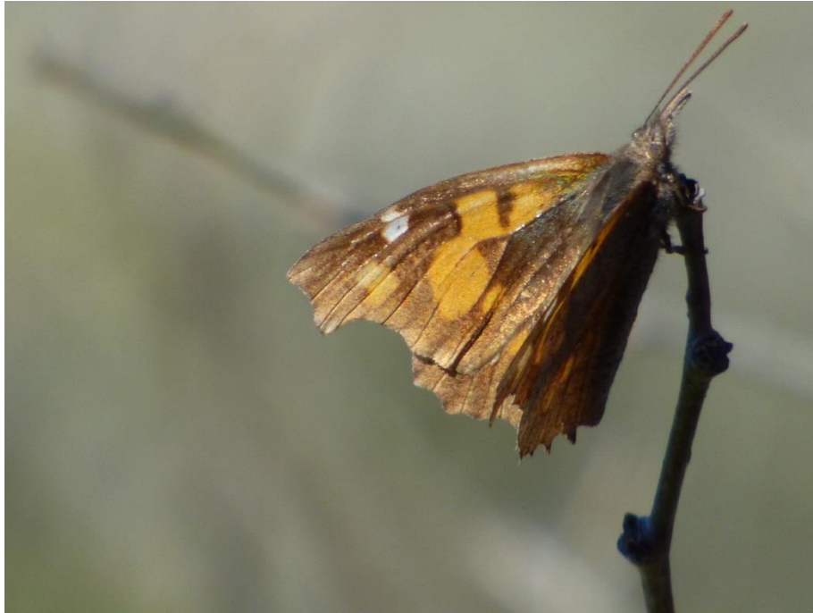
Nettle tree Butterfly

Nettle Tree butterflies were easily seen on the bare Nettle Trees in the lay-by. From there we stopped at the Fuente de Francés, where we had a picnic beside the beautiful mixed woodland on the northward facing slope of the ridge: the finest tract of natural Mediterranean woodland in Spain.