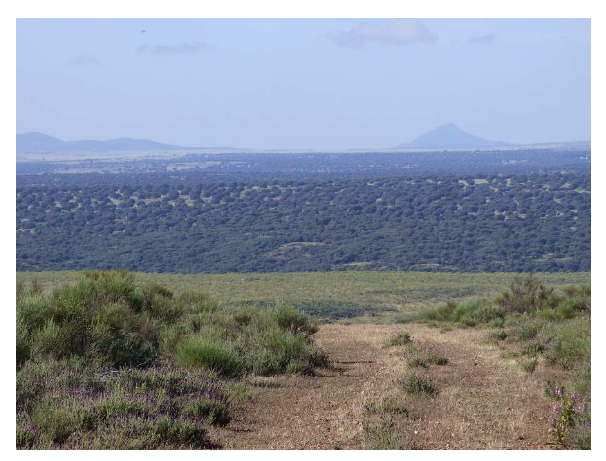
14<sup>th</sup> May 2017: Heath and cork oak groves of Jaraicejo, Miravete Pass, Cabañas del Castillo, Belén Plains

The weather had changed and we awoke to clear skies and calm conditions. As we left, we could hear an Iberian Green Woodpecker calling from the other side of the village, whilst a Wren sang from the top of a tree in the drive.