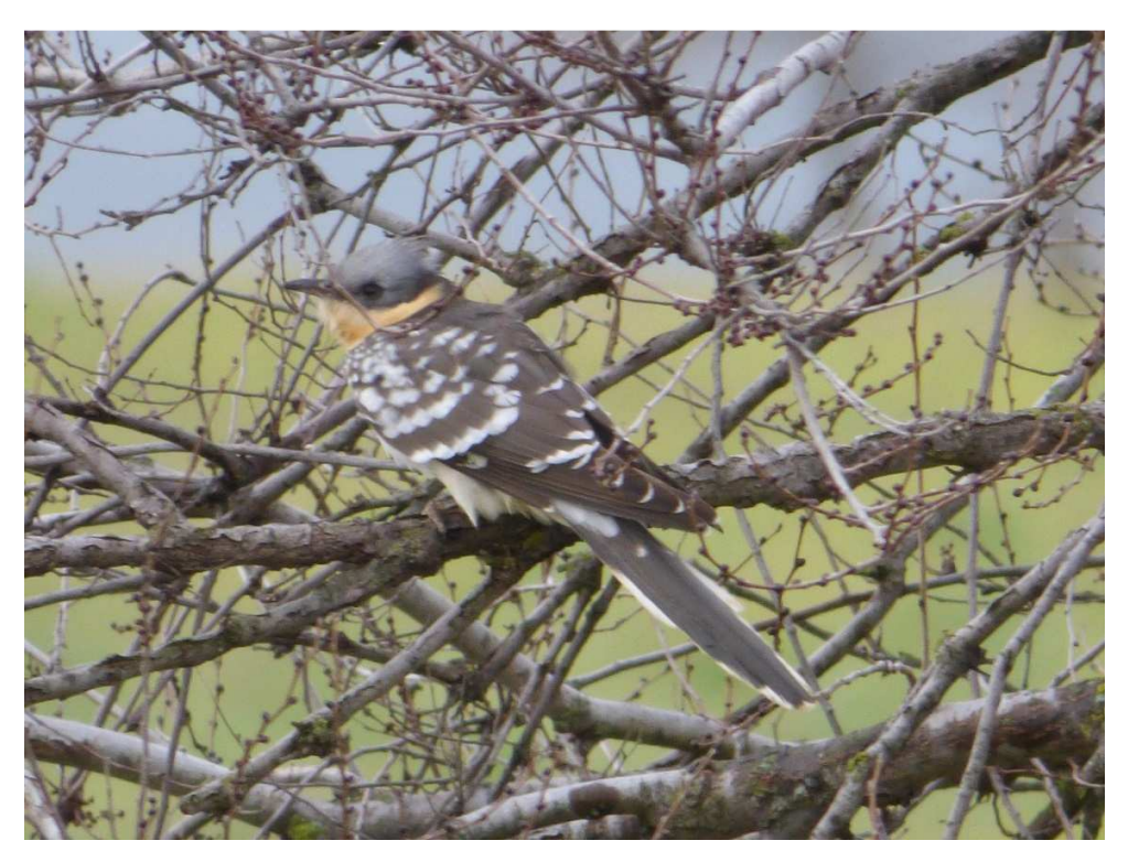
Great Spotted Cuckoo

After coffee, we drove past the town of Miajadas, to open arable land where as well as family parties of Common Crane , we watched a female Hen Harrier in unison with a female Merlin lifting a flock of Spotless Starlings and Lapwing .