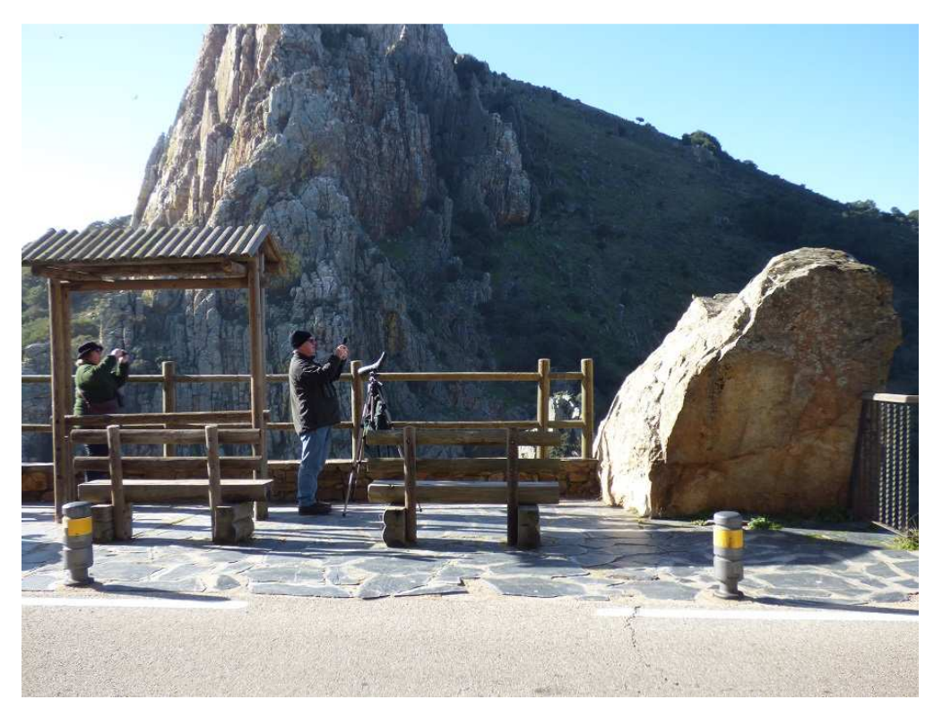
Photographing Rock Bunting