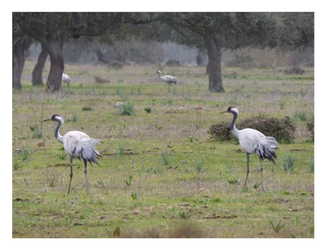
Common Cranes in dehesa