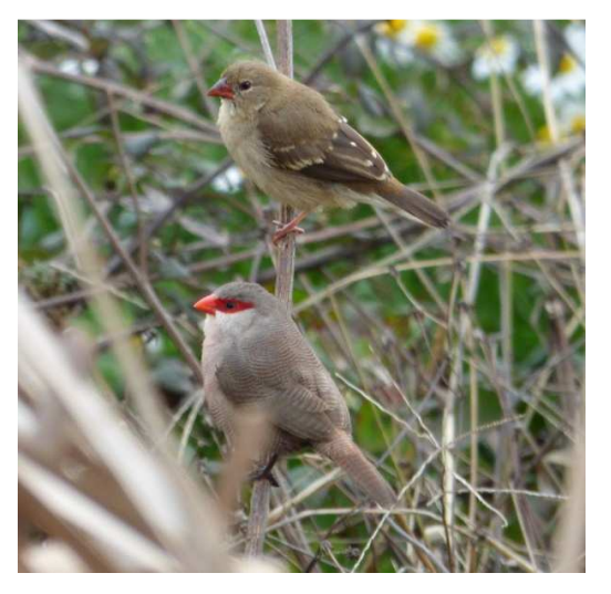
Red Avadavat and Common Waxbill