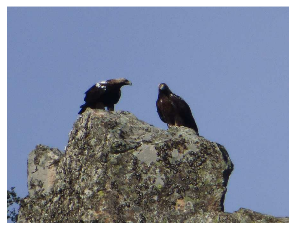
Spanish Imperial Eagles

After coffee nearby, we checked an area of cork oak woodland, seeing both Great Spotted and Lesser Spotted Woodpeckers . We then moved to an area of pine trees, where two Red Deer were feeding in a very confiding manner. We had brief views of Hawfinch and Serin here.