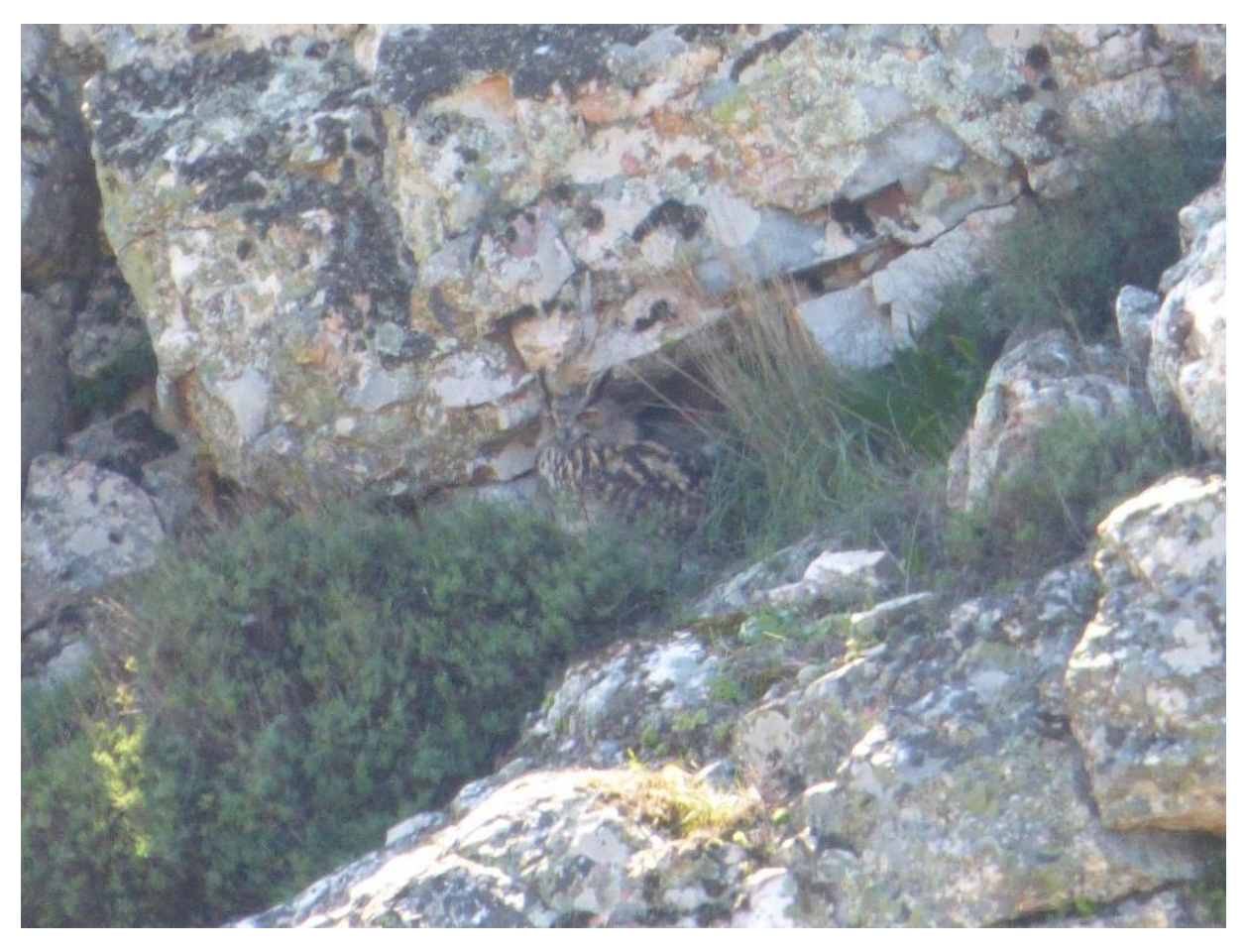
Eagle Owl number one

We took a walk beside the Tagus River, seeing small birds such as Robin and Long-tailed Tit and were rewarded with superb views of a Bonelli's Eagle , making several attempts to pick something up from the water's surface. We then made a second visit at the Peña Falcon viewpoint. This time, vultures were coming into roost and we had great views of the birds flying in to land. A Blue Rock Thrush was also seen. Best of all were views of Black Storks standing on two nest sites and in flight, wheeling close by to land. On our return journey stopped beside the River Almonte. Parties of vultures drifted overhead, but our attention was focused on a fine adult Golden Eagle which was soaring at close range. A Bonelli's Eagle also made an appearance, whilst at the water's edge, Common Chiffchaffs were coming to forage.