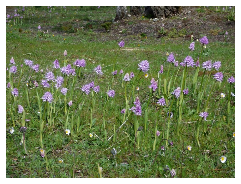
Naked Man Orchid

We then visited the hill above the town of Almaráz where in just a tiny olive grove we found five species of orchid in flower: Naked Man , Conical , Sawfly , Woodcock and the tiny, exquisite Mirror Orchid .