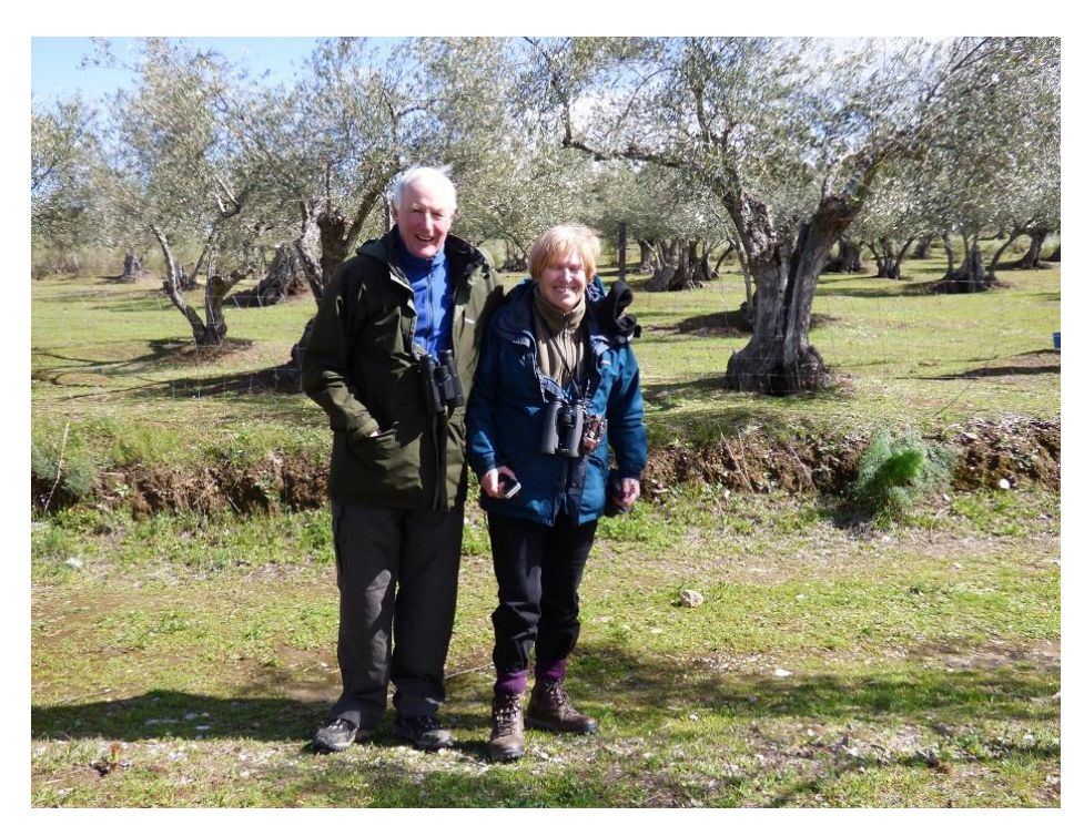
Almaráz Orchid hill

We then visited the hill above the town of Almaráz where in just a tiny olive grove we found five species of orchid in flower: Naked Man , Conical , Sawfly , Woodcock and the tiny, exquisite Mirror Orchid .