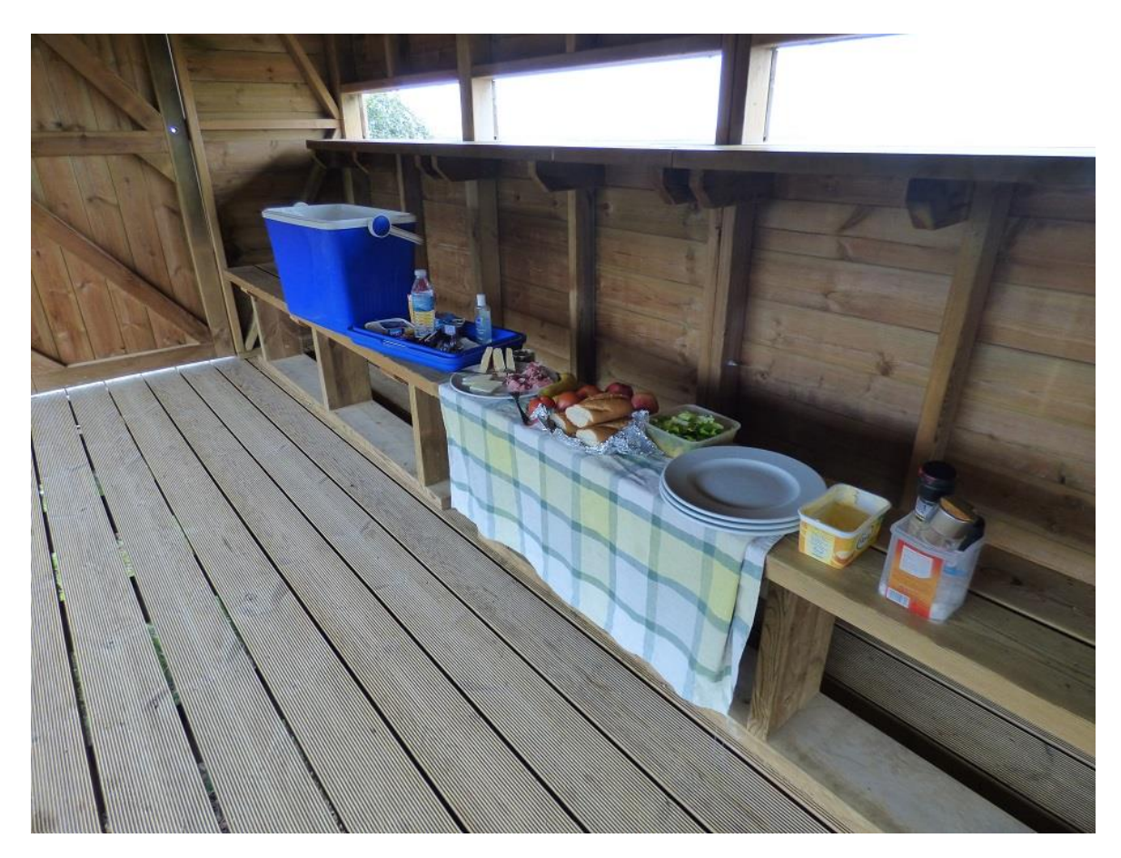
Picnic at Moheda Alta

-growing areas and dehesa towards the village of Obando. On the way we found a group of nine Common Crane and had a fine view of a Black-winged Kite .