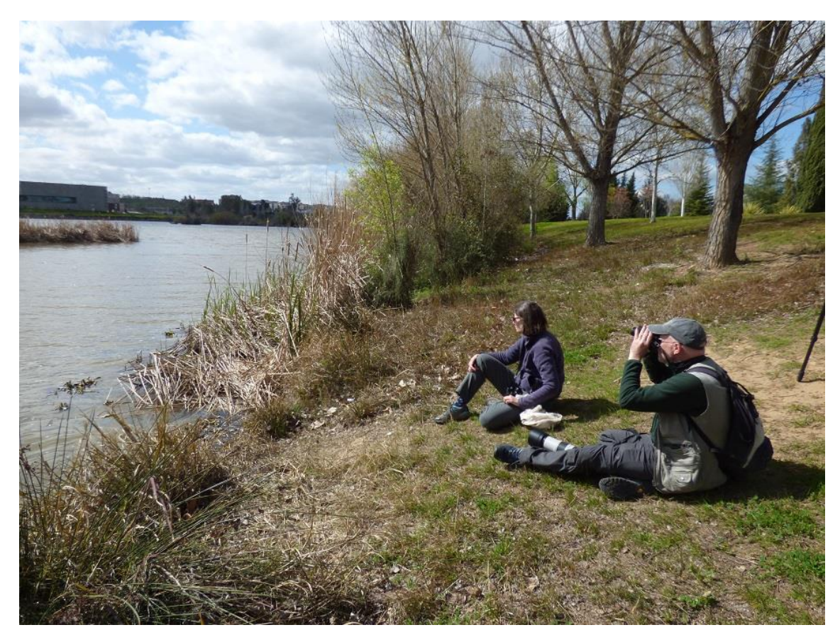
Watching Glossy Ibis in Mérida