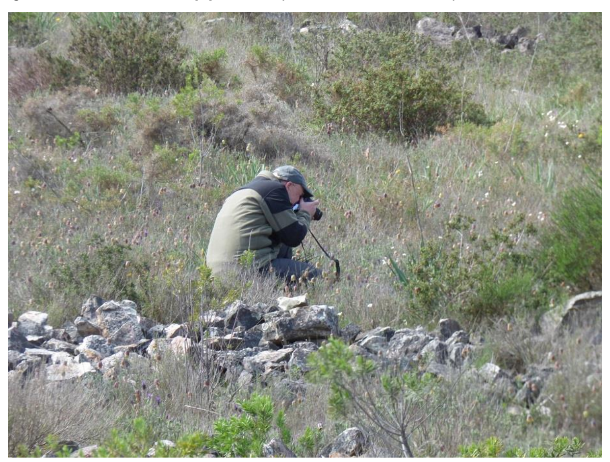
Photographing a Spanish Festoon

As we proceeded, we came across another group to the north of the road. But it was not until we were on a little dirt track did we have our best encounter with them: a party of ten large males in superb light, walking amongst a flock of sheep. The track also offered us excellent views of Short-toed Lark . At a small pool we found about almost a dozen Garganey , with other ducks, three Black-winged Stilts and a Wood Sandpiper together with a Green Sandpiper which provided a valuable comparison.