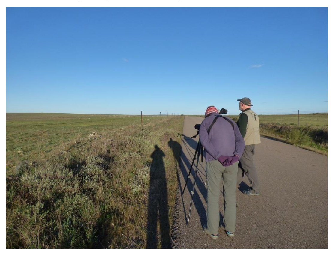
Watching displaying Great Bustards