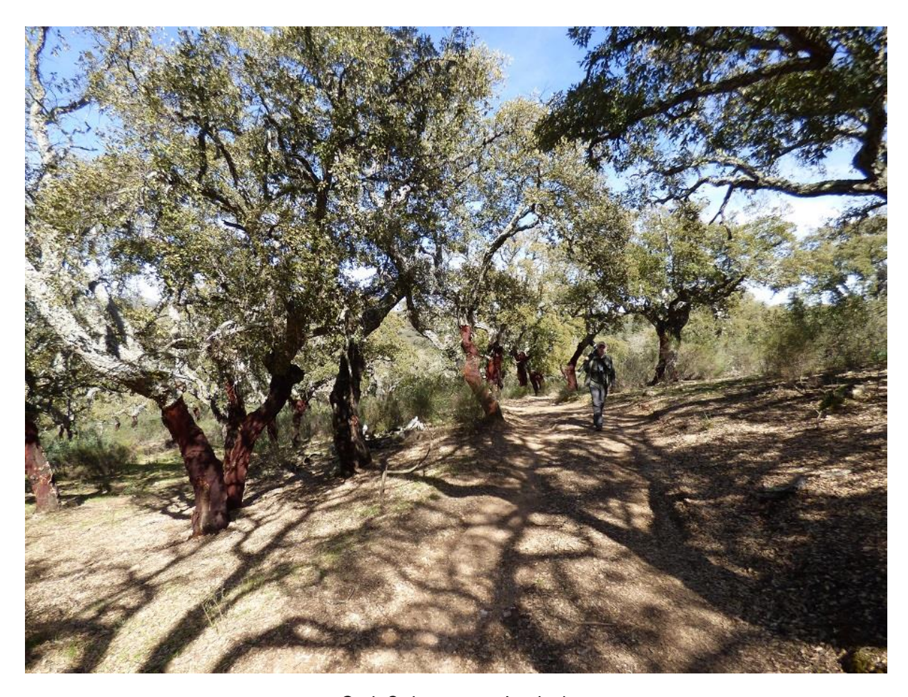
Cork Oak grove at Jaraicejo

It was another fine day with warm sunshine, tempered slightly by a westerly breeze. We spent most of the day in the region west of Trujillo, close to the village of Santa Marta de Magasca. We visited first an area of plains close to Trujillo. At our first stop we saw a male and two female Little Bustards, as well as good views of Iberian Grey Shrike and Thekla Lark. Close by we had a good view of a male Black-bellied Sandgrouse in a field and saw our first (of many) Calandra Larks. We followed that by a walk along a dirt track, where we were accompanied almost continuously by larks: Calandra, Thekla and Crested. There was even a Woodlark singing near the place we left the car. From the track we obtained very nice views of a large group of Pin-tailed Sandgrouse, as well as three Gadwall in a pool and two Black-winged Stilts.