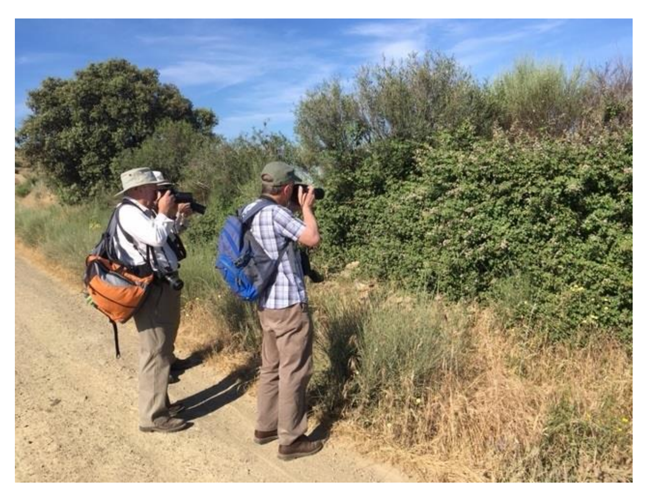
1<sup>st</sup> – 10<sup>th</sup> June 2019 Itinerary

1<sup>st</sup> June 2019 : Transfer from Madrid to Casa Rural El Recuerdo with stop at Arrocampo.