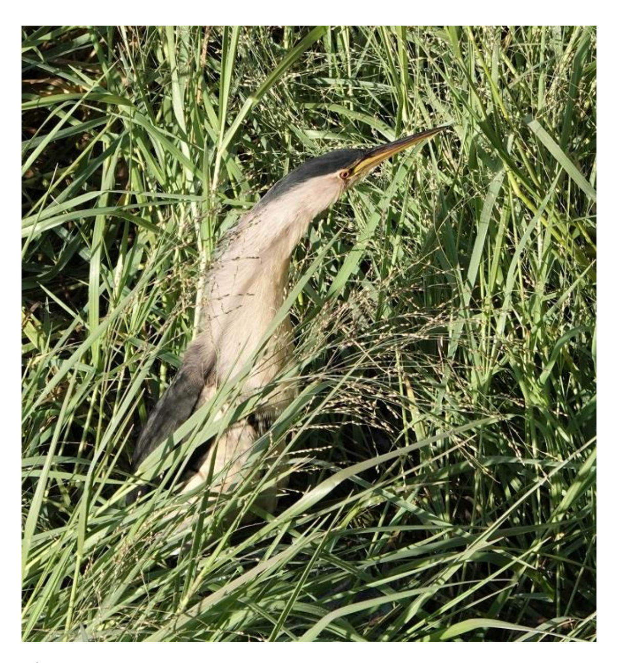
3<sup>rd</sup> December 2019: Campo Lugar plains and Alcollarín Reservoir

It was a beautiful sunny day with a somewhat fresh easterly wind. We headed southwards on to the plains of Campo Lugar. The visibility was amazing, with distant mountain ranges clear on the horizon. As soon as we stopped on the plains of Campo Lugar, we found a group of six Little Bustard and just a few minutes later, ten Great Bustards . But what was awe-inspiring was the constant sight and sound of small birds: lark song and flocks of Meadow Pipits and Calandra and Skylarks in the fields, along with numerous Lapwing and Golden Plover . On some small pools we also found a nice selection of duck including several Wigeon .