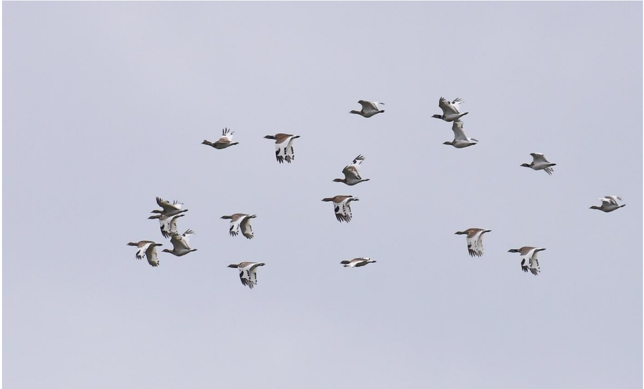
Little Bustards in flight

Birdingextremadura & Casa Rural El Recuerdo