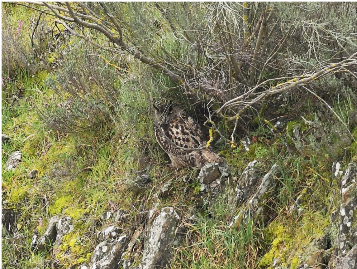
Roosting Eagle Owl

We revisited the rice fields where yesterday we had seen a large number of wagtails, but there were fewer birds this time, we had the compensation though of a nice view of a newly arrived Subalpine Warbler . We then stopped at the Sierra Brava reservoir where the treat was a roosting Eagle Owl .