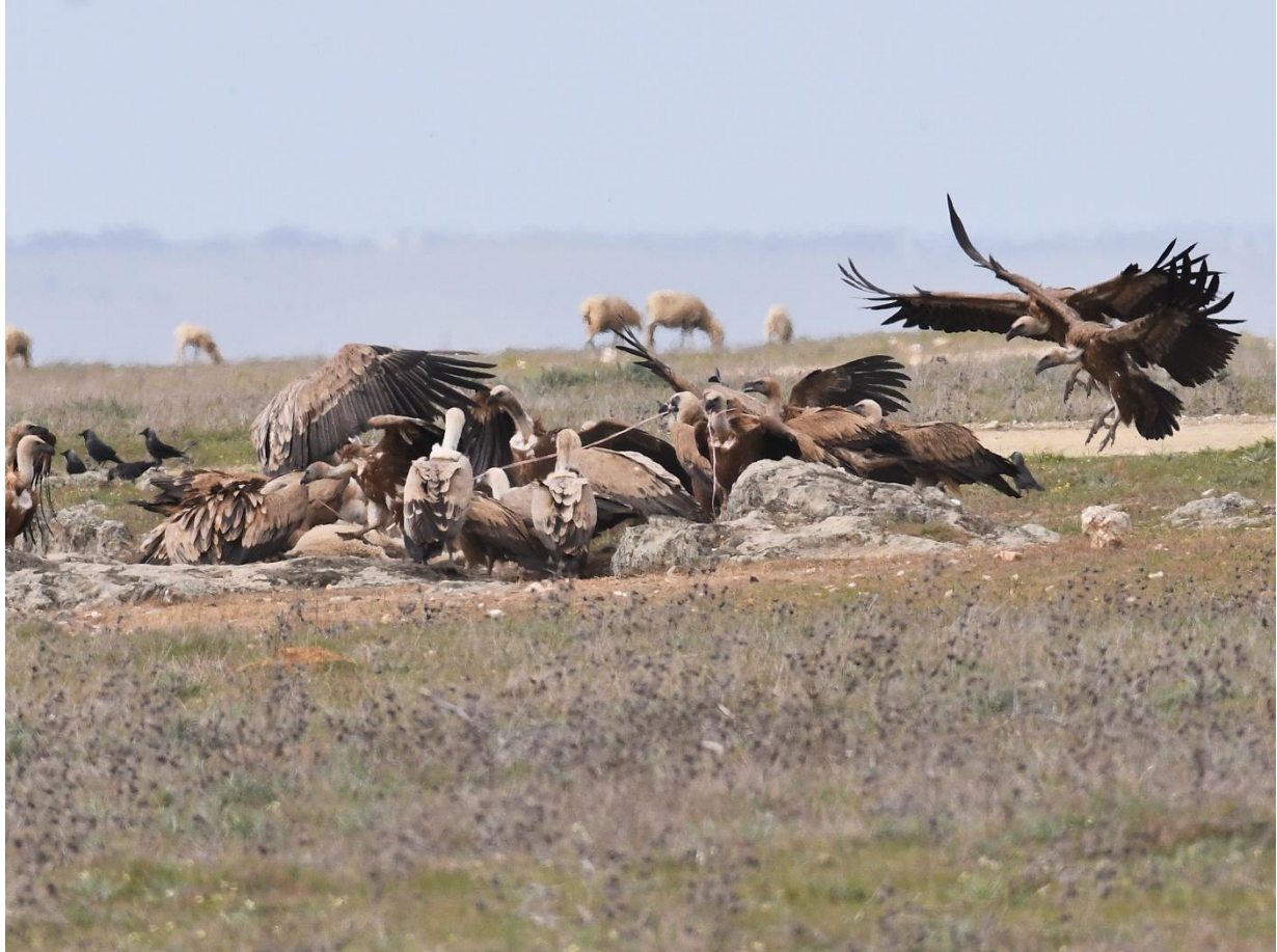
Griffon Vulture feeding frenzy

At our lunch stop overlooking the Tamuja River, we watched both a Short-toed Eagle and a Spanish Imperial Eagle in the sky together, whilst a Woodlark sang directly overhead. Nearby at the Magasca River, we enjoyed the sight of three Hawfinches in a tree together, only to be outdone a few minutes later by a group of eight!