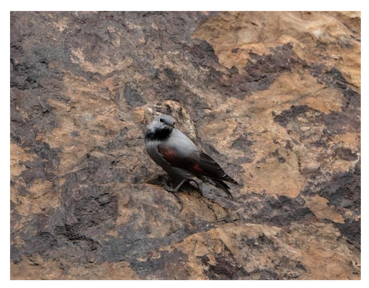
12th March 2020: Valdecañas dam, Arrocampo and Monfragüe

It was another warm and settled day. As we approached Trujillo a Great Spotted Cuckoo was being chased by a Magpie . We headed north-east, making our first stop in a small wooded valley close to the Valdecañas dam. Here there was lots of bird song: Blackcaps , Wren , Robin , but we could not detect any of the hoped-for Hawfinches.