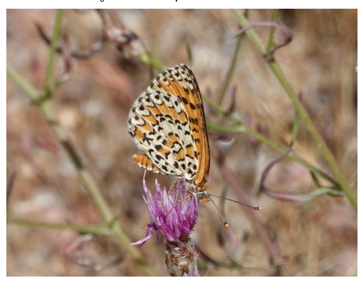
Lesser Spotted Fritillary

A little further downhill, we found Schreiber's Green Lizard , groups of Crossbills and more butterflies including several Lesser Spotted Fritillaries .