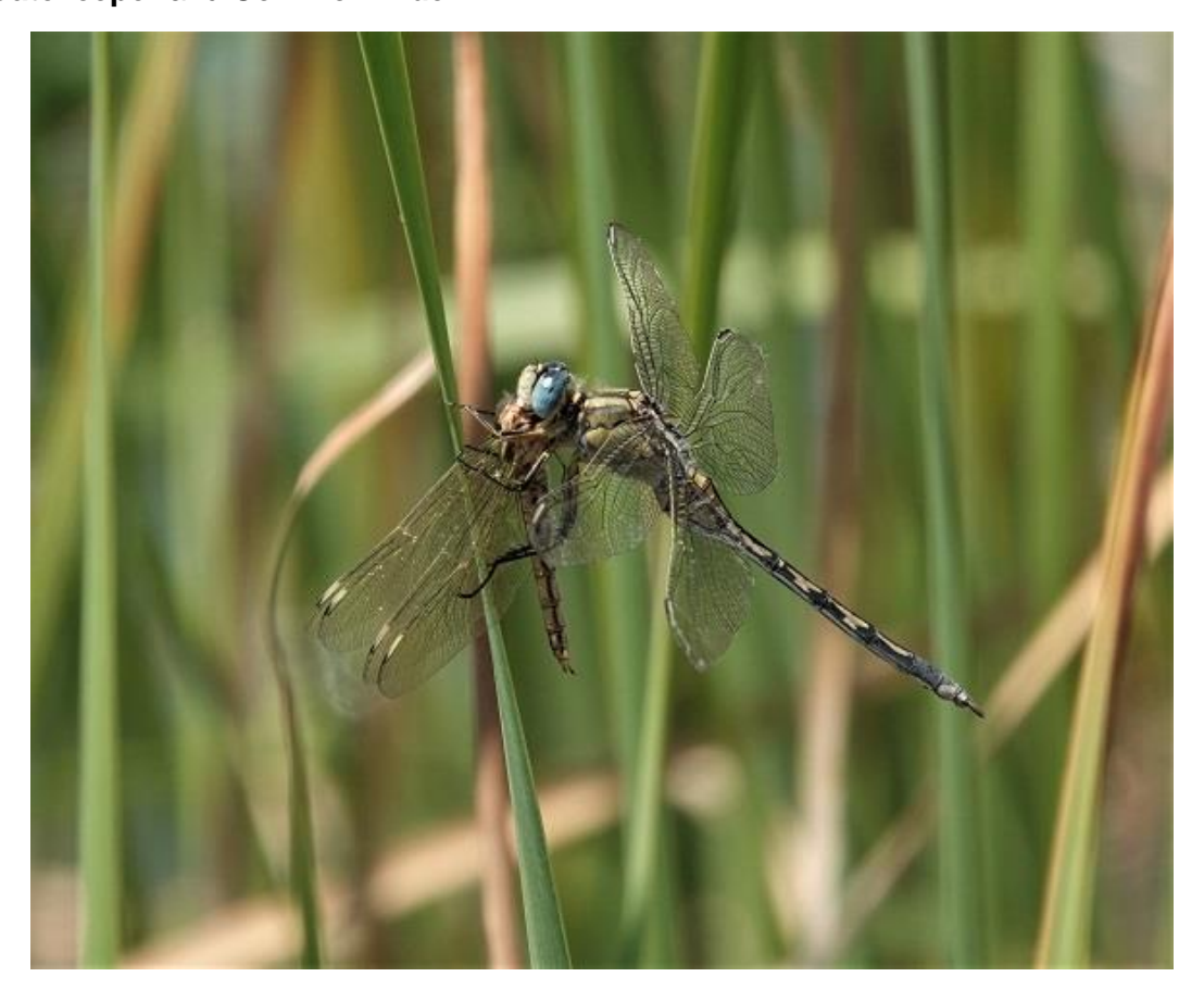
Long Skimmer eating Northern Banded Groundling

We spent the afternoon at a couple of small gravel pits just north of Casatejeda. It was a very hot afternoon (about 40° C) and not a huge number of dragonflies were on the wing. However, we did find a Green Hooktail , watched a Long Skimmer eating a Northern Banded Groundling amongst others. Butterflies included Southern Gatekeeper and Common Blue .