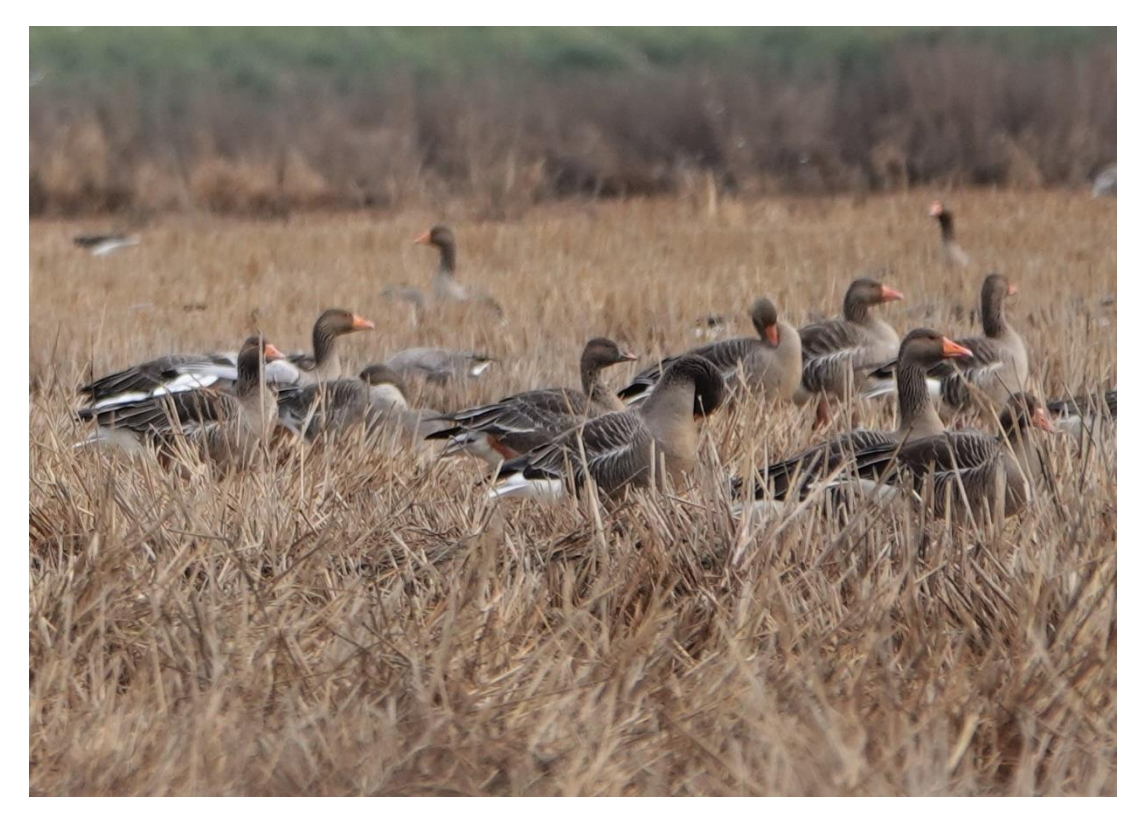
Tundra Bean Goose with Grey Lags

From there we entered the rice fields, stopping first to scan for geese, finding some distant Grey Lag Geese and amongst them an immature Greater White-fronted Goose . Cranes were feeding on the stubble fields, whilst dense flocks of Spanish Sparrows rose when flushed by Marsh Harriers . We then found large numbers of Grey Lag Geese close to the road and with great care to avoid disturbing them, we watched them from the vehicle. Together with them, we were delighted to find a Tundra Bean Goose , a rarity here. We were able to have superb and prolonged views of it.