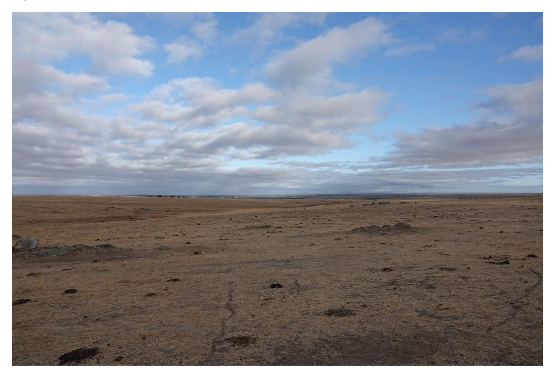
The plains: looking barren, but in fact full of birds

We had an early start in order to be on the plains west of Trujillo at dawn. It was an overcast morning, quite cool and offering superb conditions to enjoy the birding in this open landscape. The fields looked barren at first glance, but in fact the variety and above all sheer numbers of birds were superb. We quickly found two Great Bustards and then, from a viewpoint, obtained wonderful views of both Pin-tailed and Black-bellied Sandgrouse . Migrant birds were present all around us: Tawny Pipits , Common Whitethroat , Willow Warbler , Whinchat and Northern Wheatear , including a stunning male Greenland form.