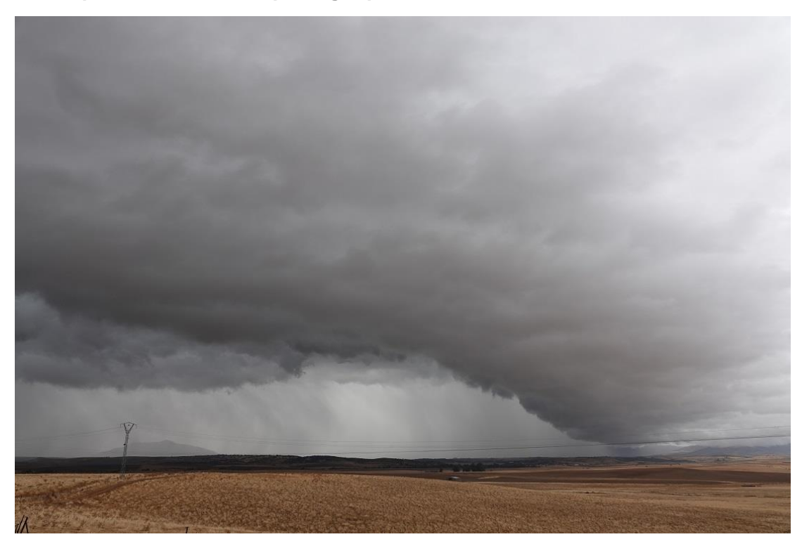
Rain front crossing the plains