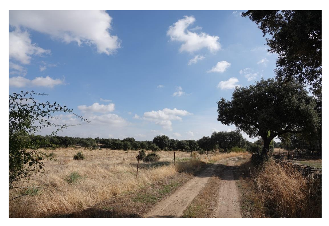
Walk beside Sierra de los Lagares

Returning to Casa Rural El Recuerdo, we had coffee and biscuits by the pool and then headed southwards to Alcollarín Reservoir. We had lunch next to the small subsidiary water body. There was welcome shade here and also some excellent distractions in the form of dragonflies, most interestingly two male Green Hooktails , as well as Lesser Emperors , Violet Dropwings and Northern Banded Groundlings . Butterflies included the African Grass Blues . Booted Eagles entertained us, as they had done the morning. At the edge of the pool, a range of waders included a Black-tailed Godwit , several Ruff and a Wood Sandpiper .