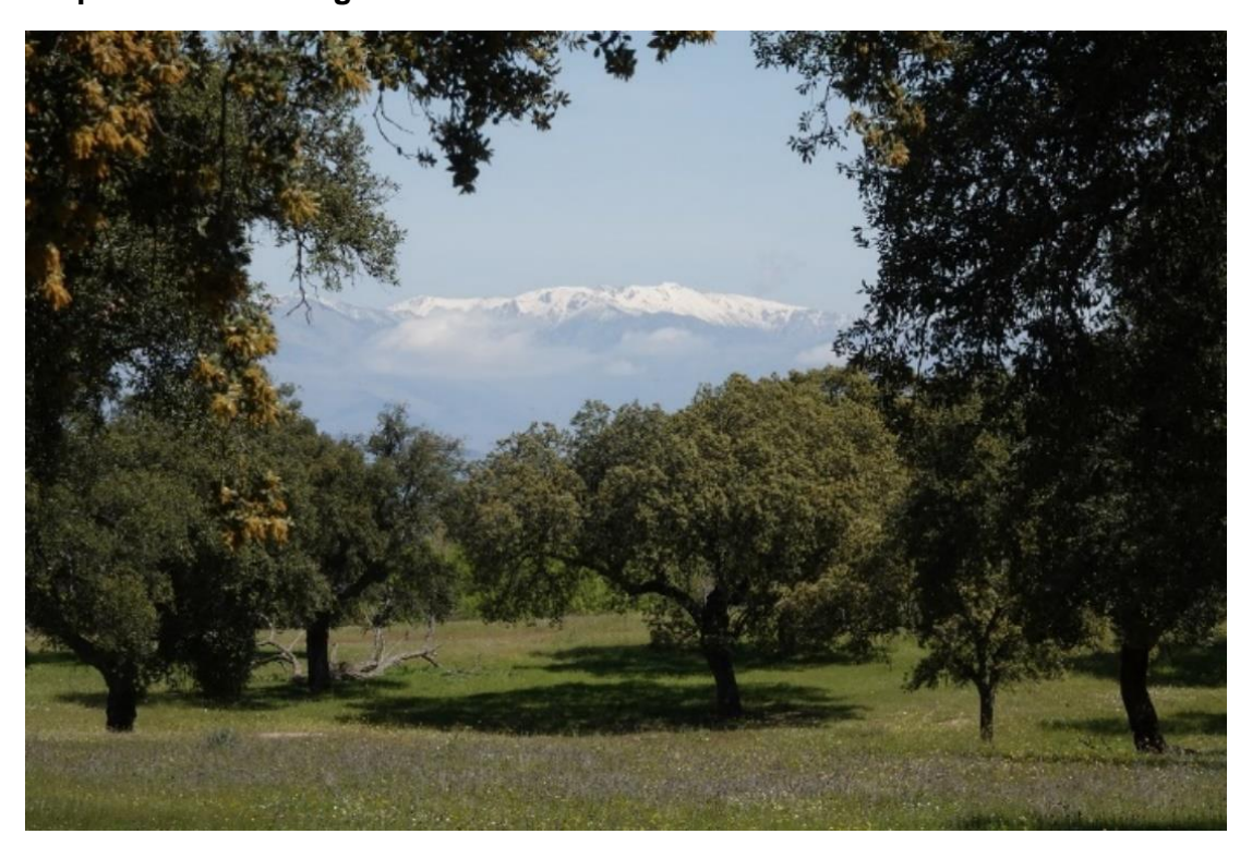
View of Gredos Mountains from cork oaks in Monfragüe

The day dawned beautifully clear and during the night Tawny Owls had been heard. A Cuckoo called constantly at first light. After breakfast we headed north through an endless dehesa landscape, a wood pasture of holm oaks stretching as far as the eyes could see, north of Trujillo to the Monfragüe National Park. At our first stop, the iconic viewpoint of Salto de Gitano we look across the Tagus River the huge cliff opposite, festooned by Griffon Vultures , waiting for the temperature to rise. It was quite chilly first thing there! We saw a Black Stork incubating on its nest, and superbly close views of Blue Rock Thrush . A pair of Egyptian Vultures made an appearance and