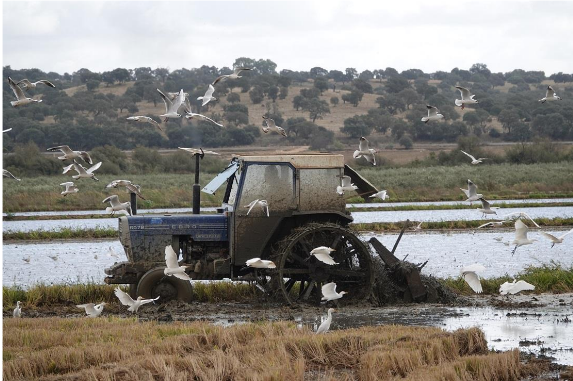
Ploughing the stubble

After coffee in Madrigalejo we continued through the fields towards the rice-town of Palazuelo. A farmer was ploughing a rice stubble field, attracting a large number of Black-headed Gulls , and egrets. It was a tremendous sight, especially with the flock of Black-winged Stilt also present.