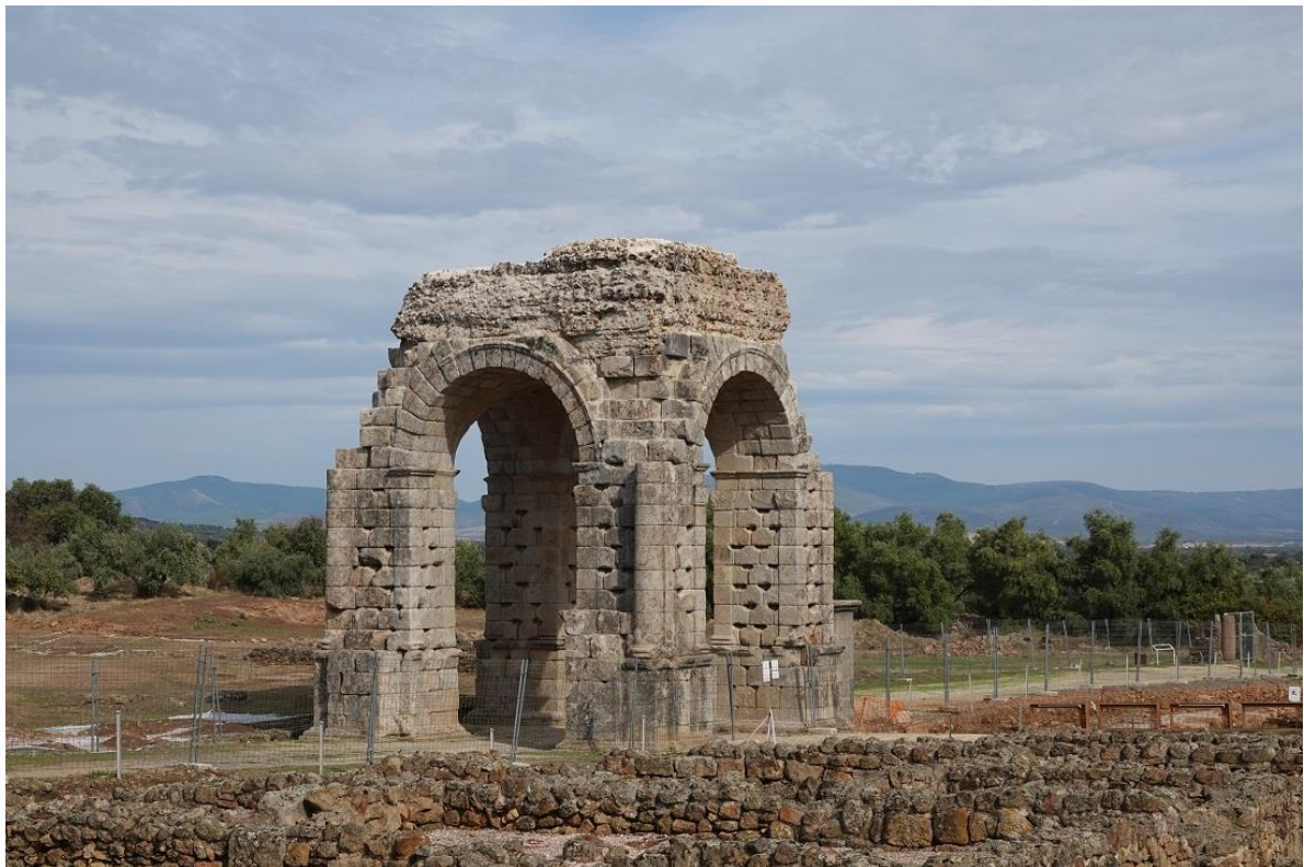
The Cáparra Arch

At Cáparra we walked around the ruins, admiring especially the impressive four-columned arch that straddled the Via de la Plata. The overall setting with olive groves, dehesa and a backdrop of the mountains was delightful.