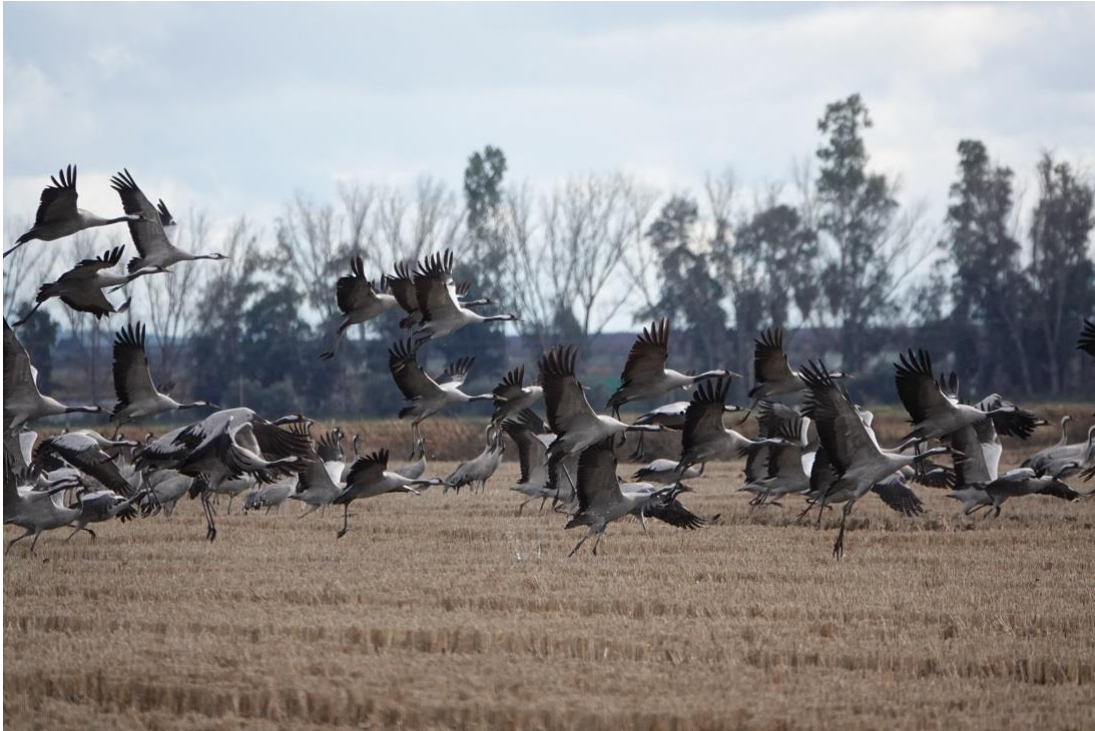
Flocks of Common Cranes

We had our picnic beside the Gargaligas River, where there were Spanish Sparrows , a pair of White Stork and a Kingfisher . We proceeded north-west to the rice fields near Palazuelo. Here again there were hundreds of Common Crane , and large flocks of Dunlin . We also enjoyed watching Kentish and Common Ringed Plover , a Little Stint , groups of Golden Plover , and a Spoonbill but the highlight was certainly a wonderful Short-eared Owl .