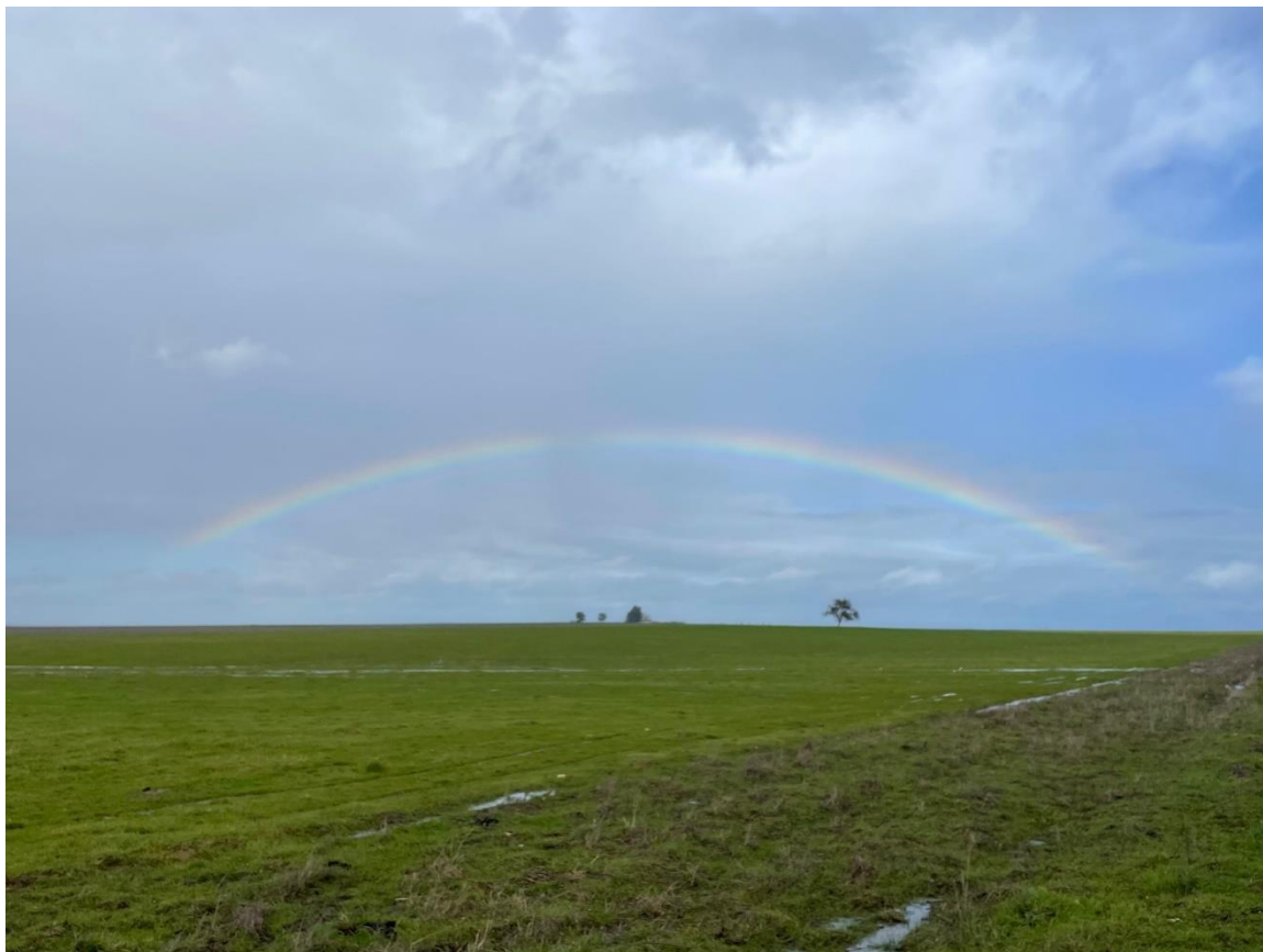
Ulrike's weather app works

27 th January 2025: Plains east of Cáceres, Tamuja River, plains north of Trujillo, Trujillo.