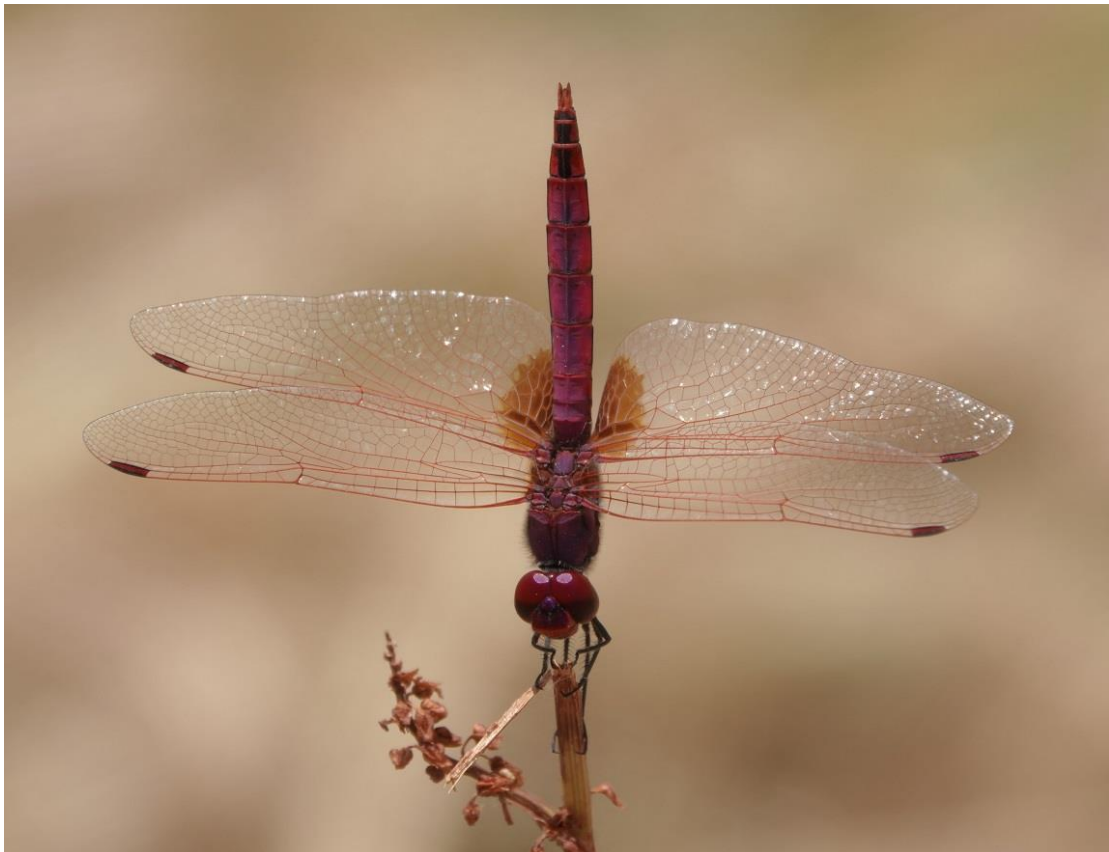
Violet Dropwing (male)

The day started rather cool with some mist. The morning was mainly overcast and with a light wind, with warmer and sunnier weather arriving in the afternoon. We headed south-eastwards, dropping to the town of Zorita then onto the nearby village of Alcollarín, behind which is a reservoir bearing the same name. Not expecting much dragonfly activity to start with, we spent an hour or so scanning the lake from the eastern shore, seeing distant Black-necked Grebe , Kentish Plover , and Spoonbill , whilst beside us was a family party of Iberian Grey Shrikes , some young Woodchat Shrikes and Iberian Magpies . Purple Herons flew overhead. We moved to the small subsidiary lake, bordered by dehesa woodland. There was very little activity insect-wise, although on the water were family parties of Little Grebe . We decided to go to check the western shore, which also was rather quiet.