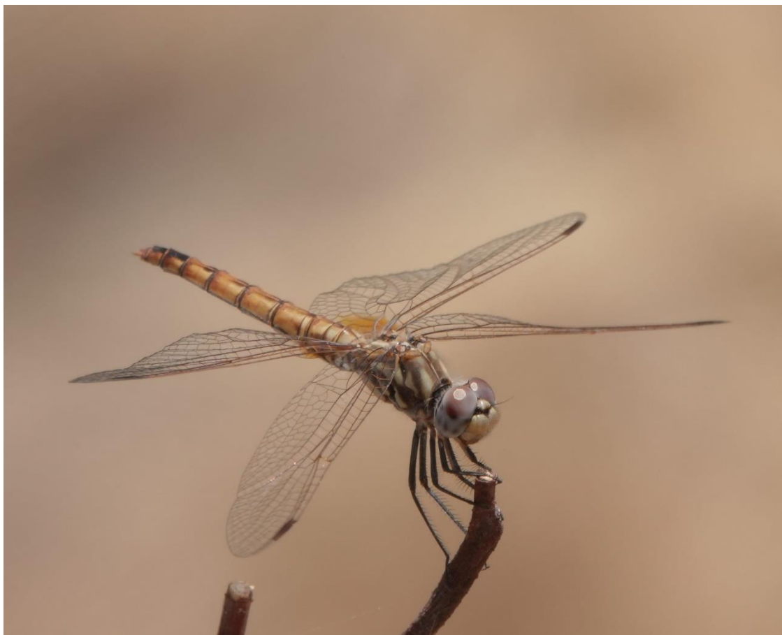
Violet Dropwing (female)

Taking a break for coffee we watched House Martins and Lesser Kestrels nesting at a silo building whilst a Roller had been seen on the way. As soon as we were back by the small lake, it was clear that things had livened-up with clusters of Northern Banded Groundlings coming to inspect us. A Violet Dropwing was present and in the vegetation we found Iberian Bluetails and Migrant Spreadwings . We stayed for our picnic and after some more exploration of the area, we decided to move to a small fishing pond near Zorita. Here there was a lot of activity. Of special interest were Long Skimmers , Epaulet Skimmer , plenty of Broad Scarlets , several Violet Dropwings , as well as Blue-eyes and Small Red-eyes . A Blue Emperor was ovipositing on the submerged stem.