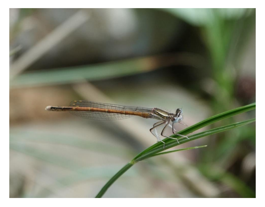
Orange Featherleg (Martin)

tree Butterflies and a Cleopatra were seen, as well as several Marsh Fritillaries . Surprisingly a Langei's Orchid was still in flower. We had lunch with a view, across the Ibor valley onto the sheer ridges of quartzite. Parties of swifts foraged overhead. We completed the afternoon beside the Ibor River where Small Pincertails perched on rocks beside the river. A Broad-bodied Chaser was very territorial. Western Demoiselles fluttered.