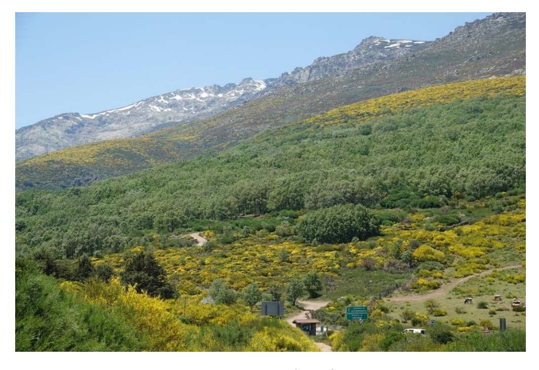
Tornavacas Pass (Martin)

Following coffee in the centre of the park, we moved northwards, driving past Plasencia and into the Jerte valley, the largest cherry-growing area of Spain. We drove all the way up the valley to stop at the Tornavacas Pass, on the border between Extremadura and Castille y León.