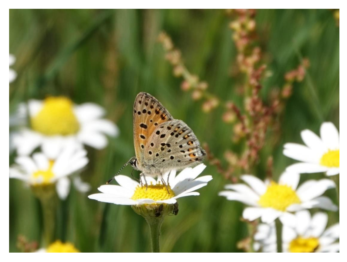
Sooty Copper (Martin)