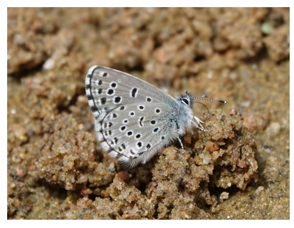
Panoptes Blue (Martin)