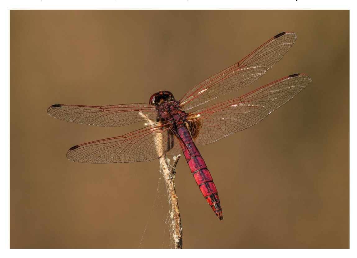
Violet Dropwing (Lesley)

It was another hot and sunny day, and we elected to spend as much as possible of the day beside water. We started off, however, with a short stop at the Miravete Pass to get a clear view across to the Gredos Mountains. A Red-legged Partridge was feeding on the track as we arrived, and Short-toed Treecreepers sang. We then descended to the plains to the north and spent a very productive time beside a small pool near Casatejadas where the most common dragonfly was the Violet Dropwing . Also present were Epaulet Skimmers , Black-tailed Skimmers , Red-veined Darter , a Southern Darter , Iberian Bluetails and Blue-eyes .