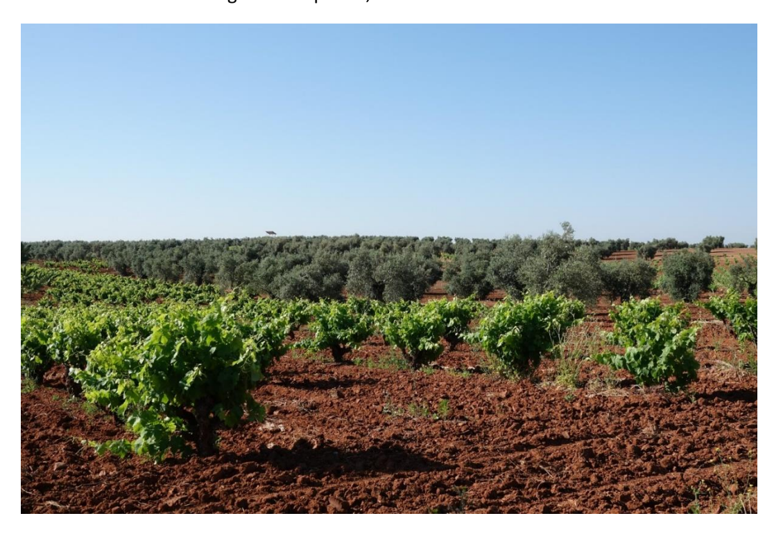
Habitat of Rufous Bush Robin

Almendralejo, surrounded by a vast landscape of vineyards and olive orchards. This was the preferred habitat of our sought-after species, the Rufous Bush Robin .