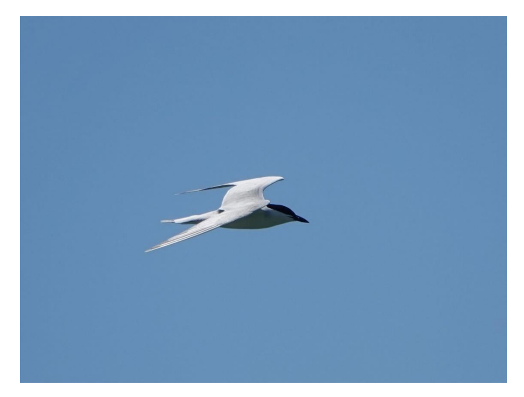
Gull-billed Tern (Martin)

Martin met George and Lesley at 11.00 at Madrid airport, and we were quickly heading out around the southern ring-road and then onto the motorway leading to Extremadura. The traffic was light throughout. After a quick snack, we spent the afternoon at Arrocampo. Here a lake which provides cooling water for the Almaraz nuclear power plant, had a fabulous fringing vegetation of lesser reed mace, home to a superb section of birds. Within minutes of arriving, we were listening to Savi's Warbler, Common Reed Warbler and Cetti's Warbler. Overhead passed Black Vulture and Griffon Vulture whilst Gull-billed Terns flew over the water.