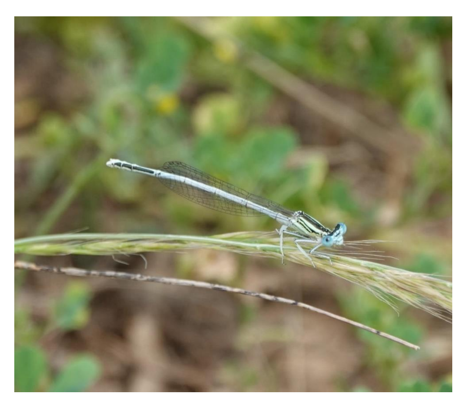
White Featherleg (Martin)

We saw two species of Featherlegs : Orange and White . Butterflies included Brown Argus and Long-tailed Blue .