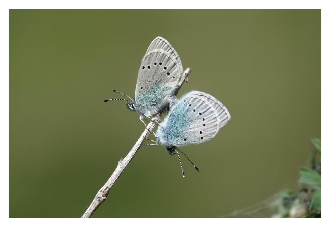
Green Underside Blue (Martin)

Here we had our picnic and followed that by a walk which yielded Red-backed Shrike and Dartford Warbler , as well as several Common Whitethroats . The flowers were superb, especially the banks of Lupinus gredense .