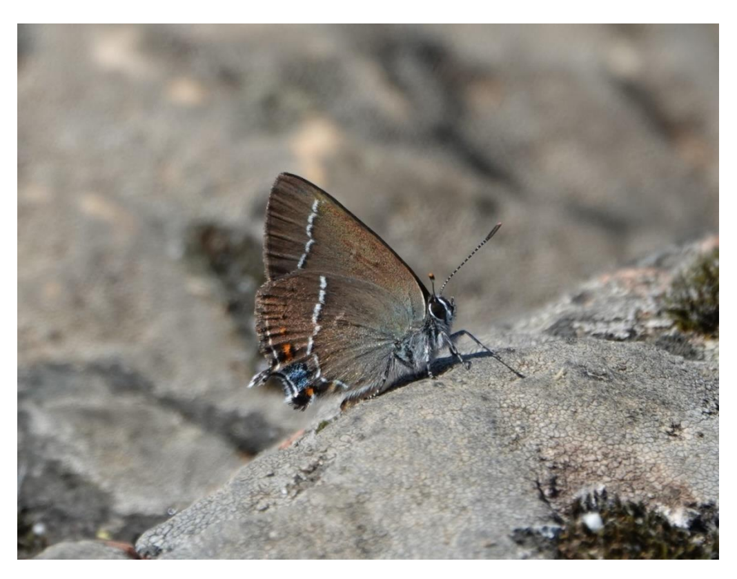
Blue-spot Hairstreak (Martin)

Following coffee in the centre of the park, we moved northwards, driving past Plasencia and into the Jerte valley, the largest cherry-growing area of Spain. We drove all the way up the valley to stop at the Tornavacas Pass, on the border between Extremadura and Castille y León.