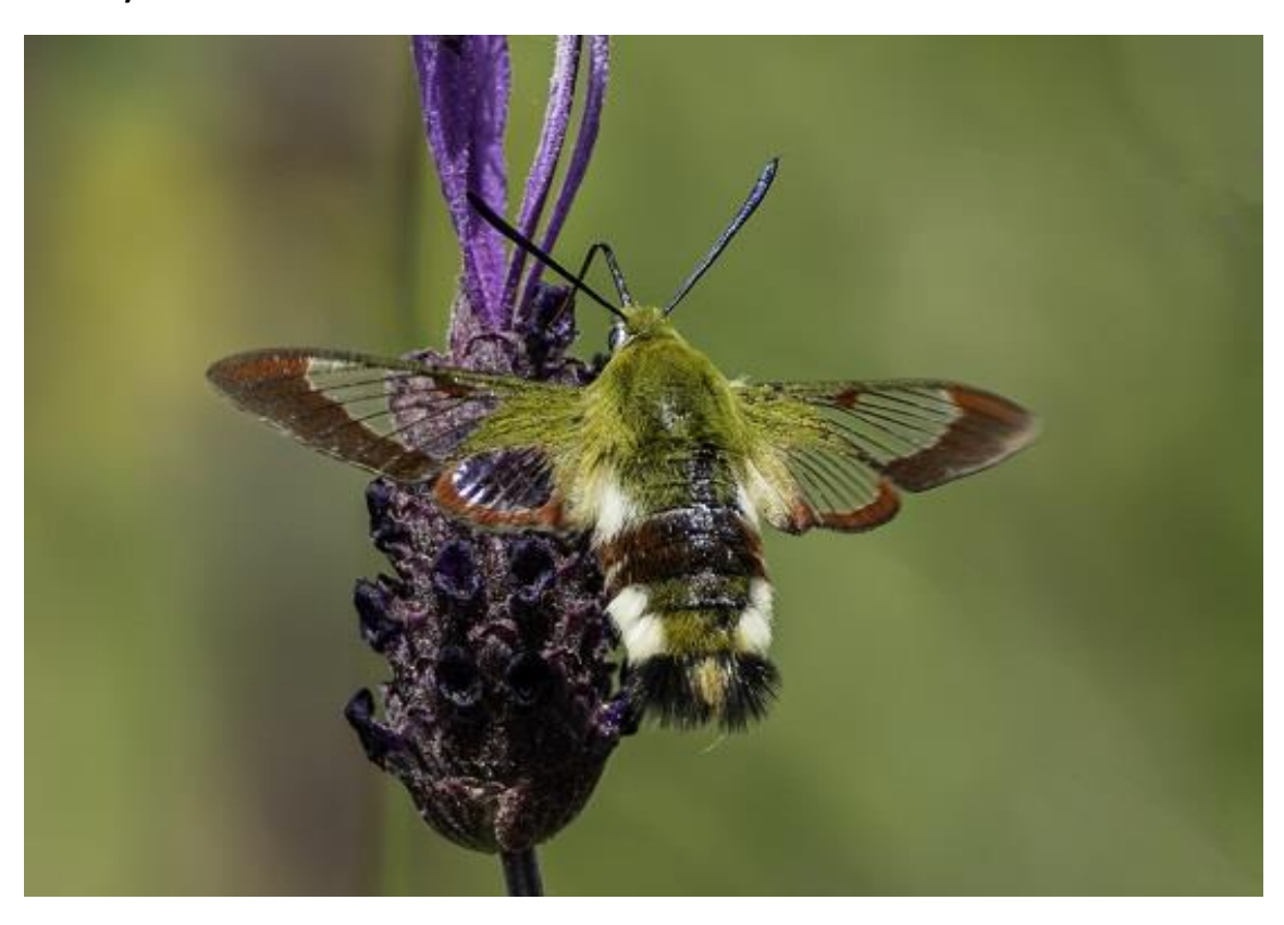
Broad-bordered Bee Hawk Moth

After lunch in Bejar we drove to Candelario and then into the deciduous oak and pine woods between the town and La Garganta. A Honey Buzzard was seen, and two Iberian Chiffchaffs were singing. As well as numerous Marsh Fritillaries , we also found a Large Wall Butterfly and Black-eyed Blues .