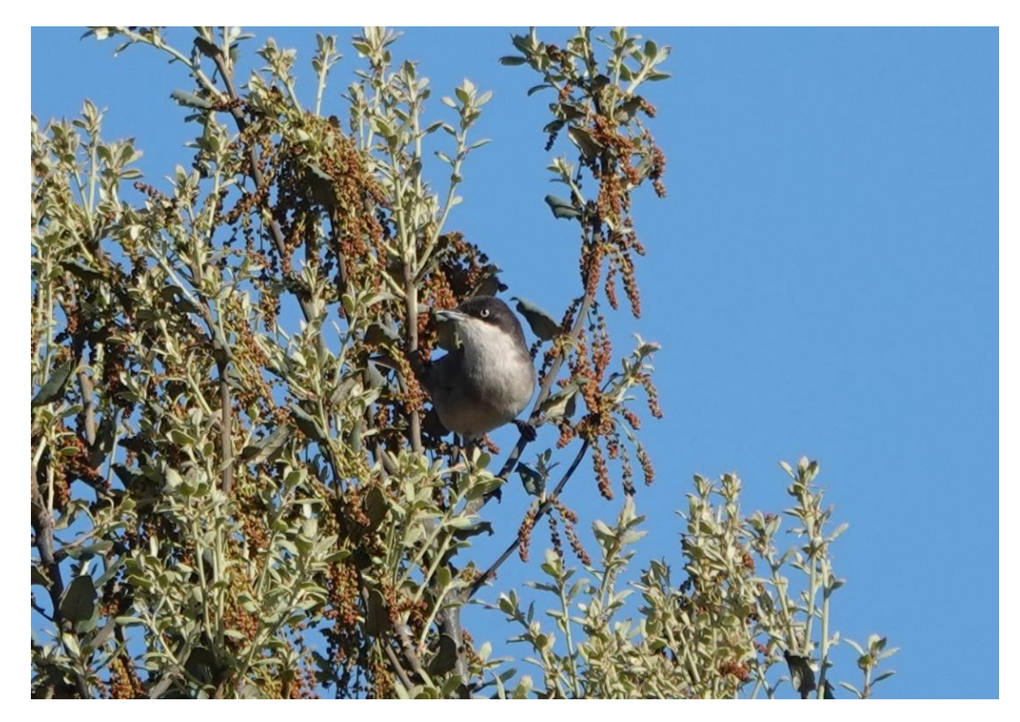
A Subalpine Warbler was also present and we also came across a delightful male Lesser Spotted Woodpecker , excavating a nest hole. Large Psammodromus lizards and Moorish Geckos were basking on the warm stones of the bridge.