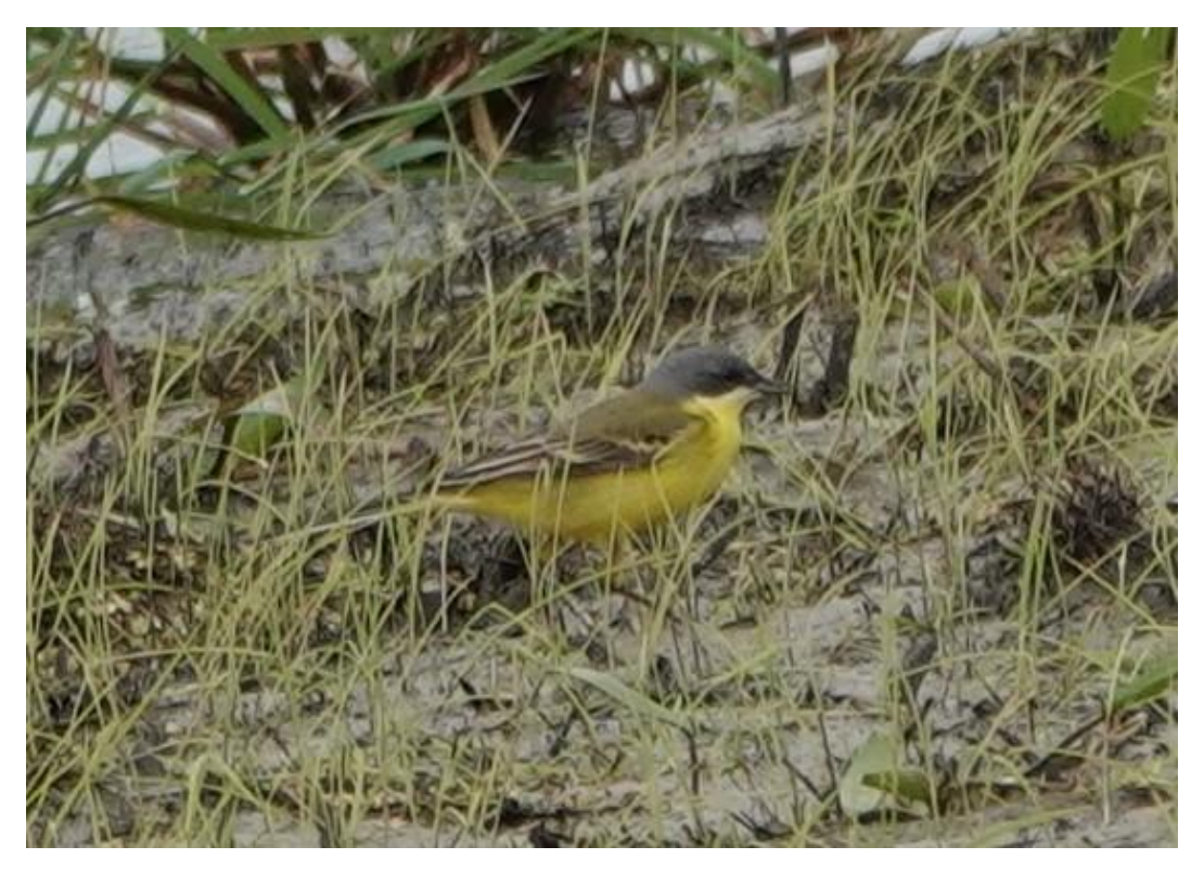
3<sup>rd</sup> April 2025: Palazuelo rice fields, Madrigalejo and Vegas Altas

The afternoon was spent in the rice fields near Palazuelo. Some of the fields were dry, some stubble, others were wet and muddy. We searched for waders, pretty much without much success, only a couple of Common Redshank, Green Sandpiper and Kentish Plovers were seen. However, we came across a field heaving with wagtails. There must have been about fifty Yellow Wagtails of four different races, including the Fenno-Scandinavian Grey-headed Wagtail. The majority of those present were migrant Blue-headed Wagtails, and there were also a few Yellow Wagtails too. A Water Pipit was also there, along with some Meadow Pipits.