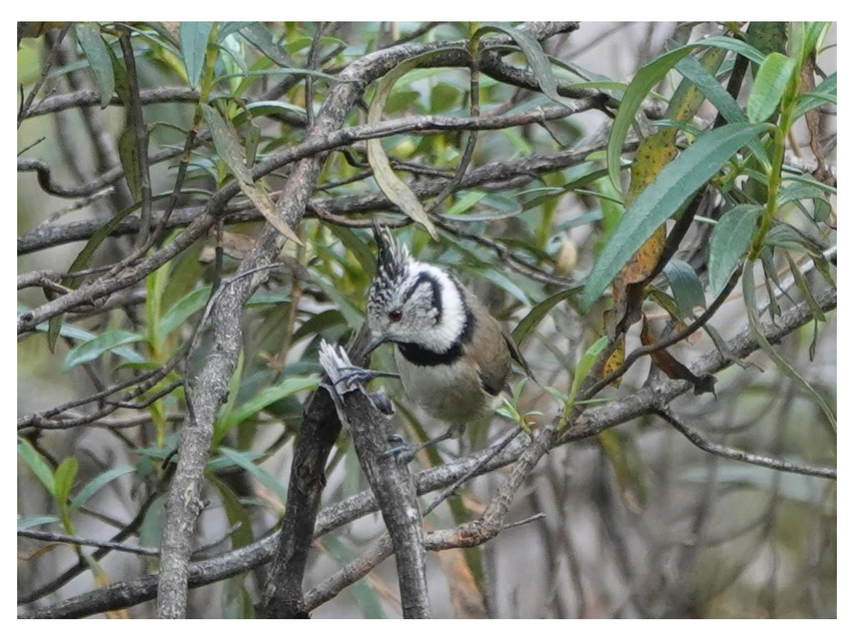
2<sup>nd</sup> April 2025: Campo Lugar plains, Madrigalejo and Palazuelo rice fields

There was more cloud cover today, although still some sunny periods, but the wind became fresher in the afternoon and there was rain late afternoon.