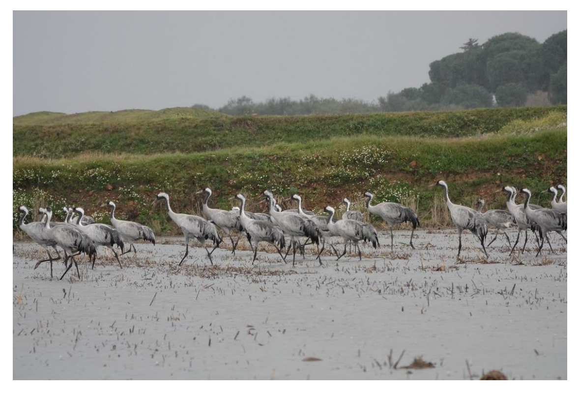
Common Cranes in the rain

We then headed west chasing the last of the sunny weather. We stopped for a picnic beside a pool near the Orellana Reservoir, where there were parties of Gadwall , Coot and Great Crested Grebe . By the time we had finished, the rain had set in. We spent the afternoon driving through the rice fields near Vegas Altas and Madrigalejo. There were wonderful numbers of Common Cranes , mostly in large flocks. We had a good view of a Black-winged Kite on a tree in front of us, and then a few minutes later we saw a second bird. The conditions made it difficult to scrutinise the rice fields for other birds, so by 16.00 we decided to throw in the towel and return to base.