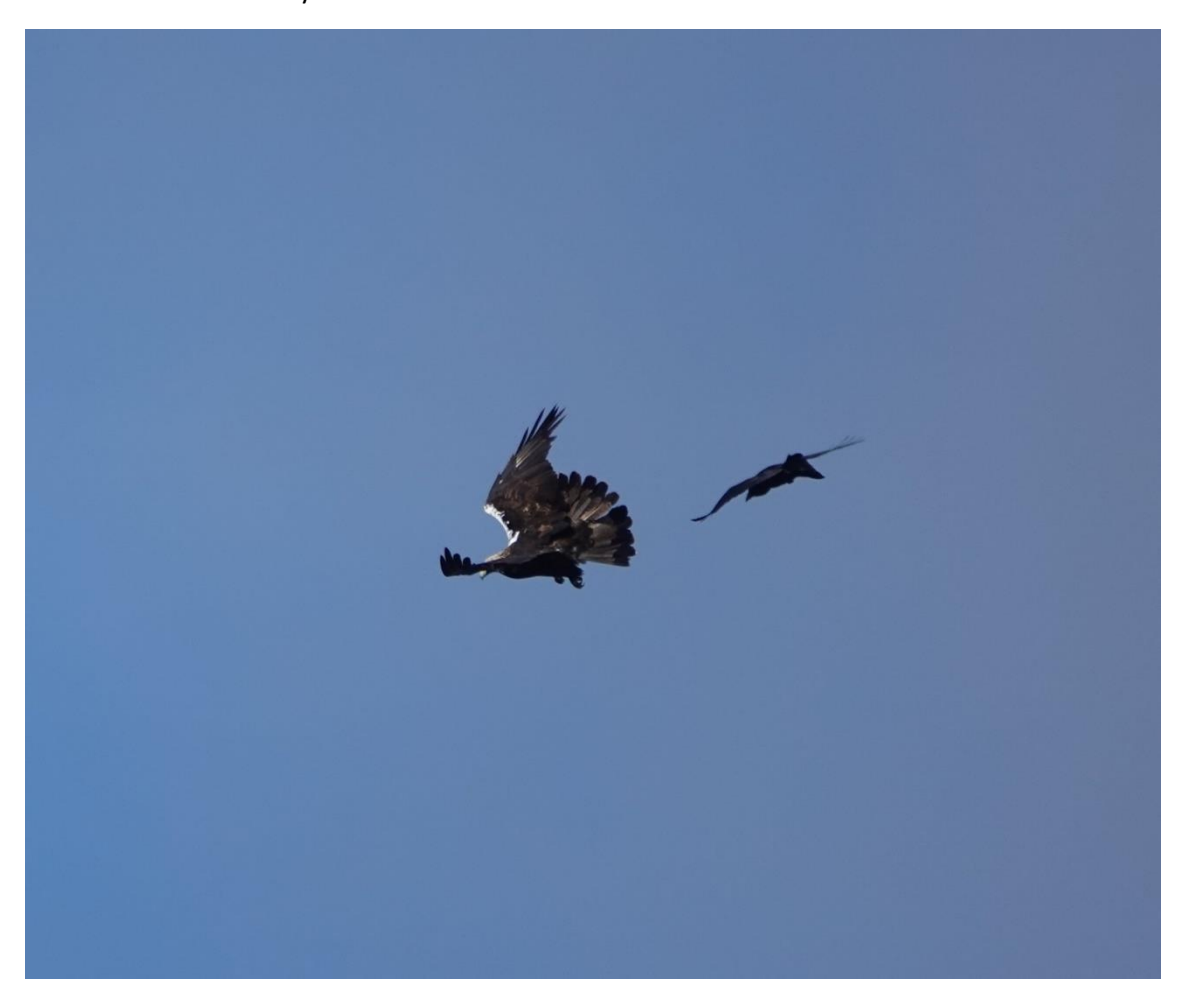
Spanish Imperial Eagle and Raven

After a coffee in the village, we returned to admire the view over the Tamuja River. It was perfect timing since as soon as we stopped, we found a Spanish Imperial Eagle flying overhead with some vultures. Over the next few minutes we watched it as it performed as skydance and then was mobbed furiously by a Raven . Only when it almost disappeared over the hillside did its patience snap and it saw off the Raven with a chase. From the vantage point we also saw a Sparrowhawk and several Red Kites . A Woodlark sang close-by, sometimes from a tree, sometimes from the sky above us.