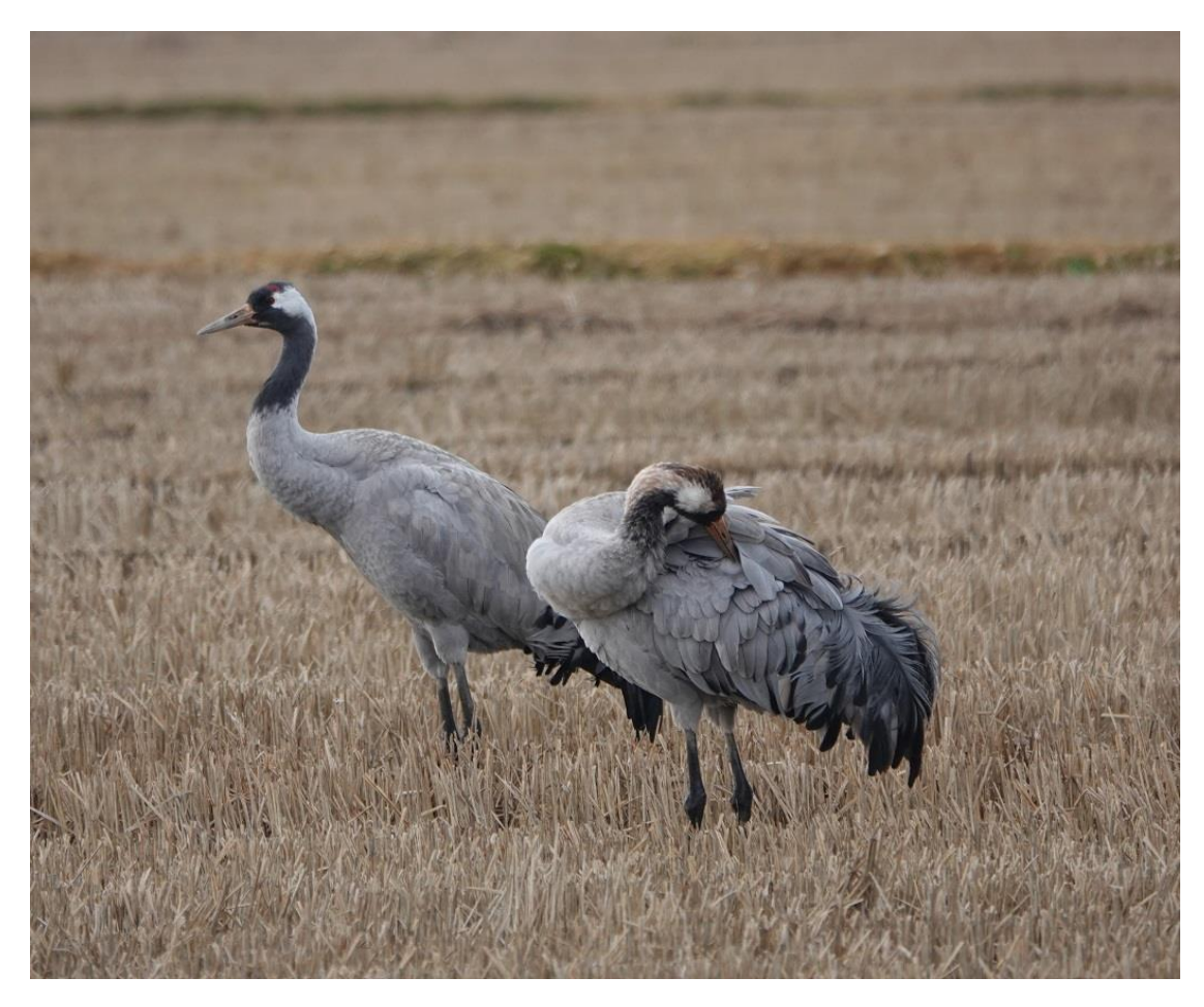
Adult and juvenile Common Crane

We focused on the rice fields near the towns of Madrigalejo and Palazuelo, in the hope of seeing Common Cranes and we were not disappointed. During the day we must have seen over five or six thousand cranes, some as family groups of three or four, but also two very large flocks.