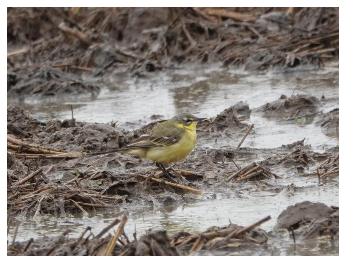
Blue-headed form of Yellow Wagtail

In the first area we explored, Casas del Hitos, the cranes were generally in small groups. As we watched we also had a lovely view of a male Hen Harrier , gently quartering the fields. There were flocks of Spanish Sparrows and in the fields a mixture of Yellow and White Wagtails , Meadow and Water Pipits .