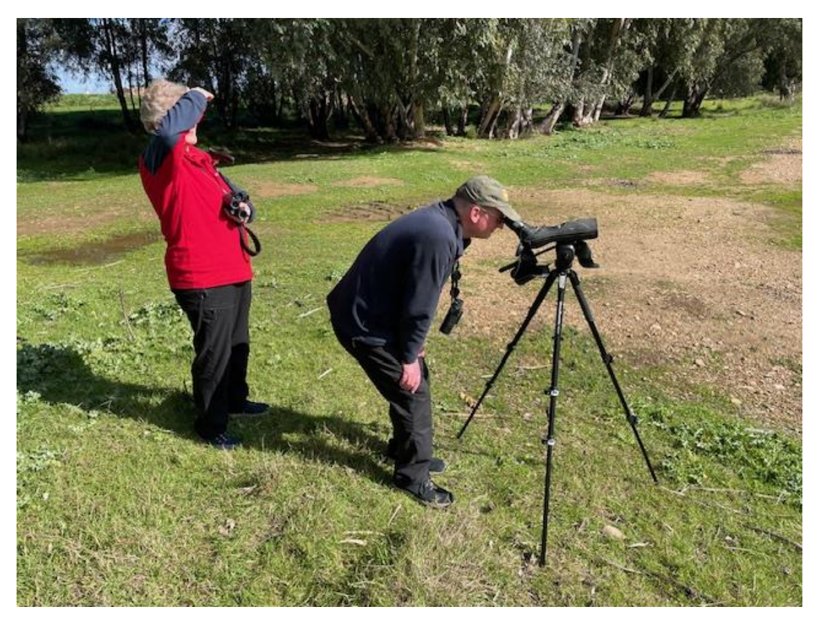
Watching Eagle Owl